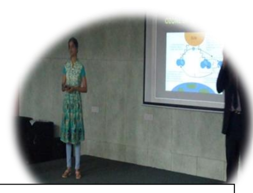
Students presenting theme on Global warming & Climate change warming