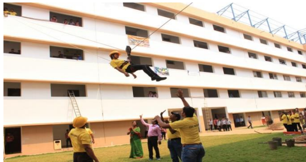
(Rescue from height)