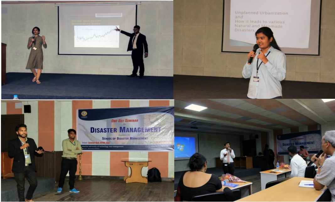
(Students delivering the seminar topics)