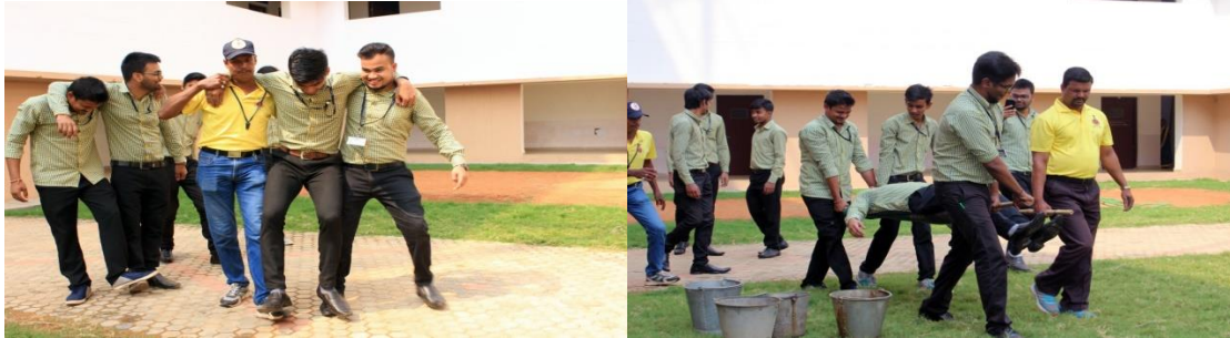
(Rescue from ground)

Organized by: School of Disaster Management