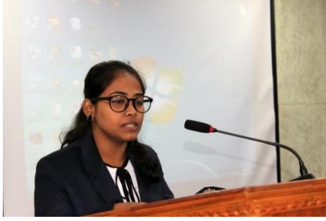
(Vote of thanks by a student on behalf of SDM)