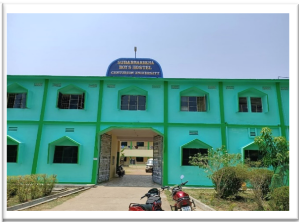
Centurion University Hostel converted to 100 beded COVID hospital