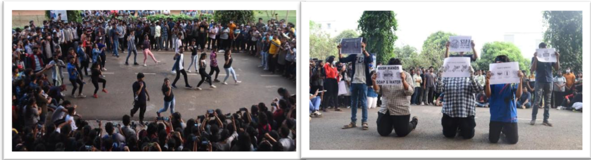
Flash Mob: A Street Play on COVID-19: The Pandemic Flash Mob: A Street Play on COVID-19: The Pandemic

Awareness on Ocular exercise: It became imperative for physical classrooms to transform to online classes during the COVID pandemic. Needless to say the health of the students, particularly the eyes were affected due to prolonged exposure to computers and mobile phones screen. Owing to the same, events such as awareness and demonstration of Ocular exercise were organized in the year 2021.