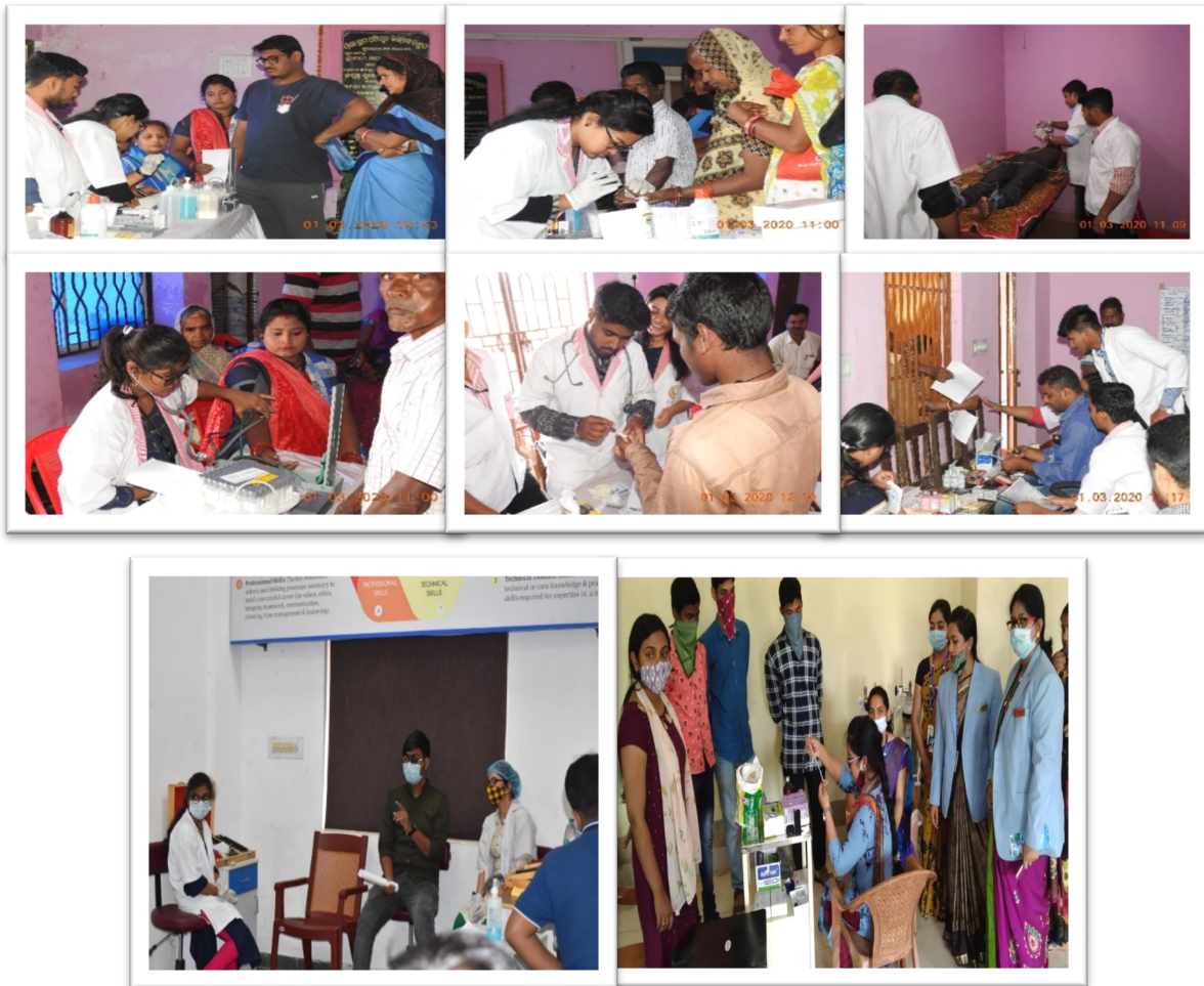
Health camp organized at Janla Panchayat