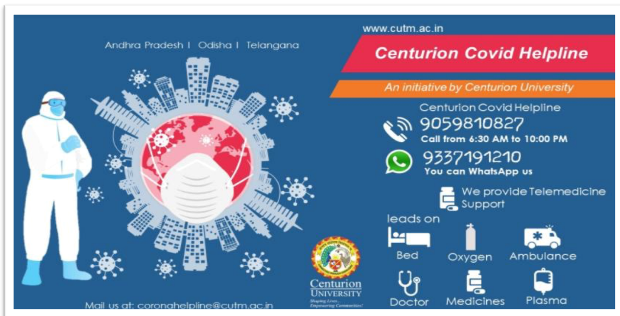
COVID- 19 Helpline Service by Centurion University

During the pandemic, there was a sense of despair; government was unable to cope with the demands of the emergency situation which led to a chaotic situation. In the year 2020, a team of students, staff and faculties volunteered to establish a 24X7 helpline to provide information regarding support services available. The Centurion COVID Helpline adhered to the guidelines of World Health Organisation and Government of India. The information provided related to availability of hospitals, beds, medicines, Oxygen and food. The qualified paramedical team had assisted the callers on post COVID precautions through the helpline .