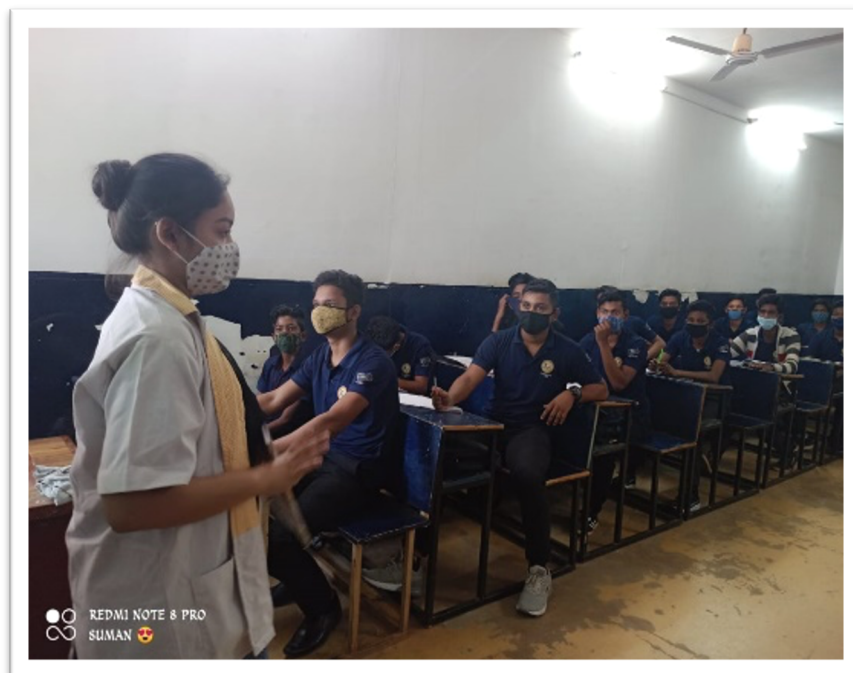
Awareness on Eye exercises during Pandemic

Awareness on Ocular exercise: It became imperative for physical classrooms to transform to online classes during the COVID pandemic. Needless to say the health of the students, particularly the eyes were affected due to prolonged exposure to computers and mobile phones screen. Owing to the same, events such as awareness and demonstration of Ocular exercise were organized in the year 2021.