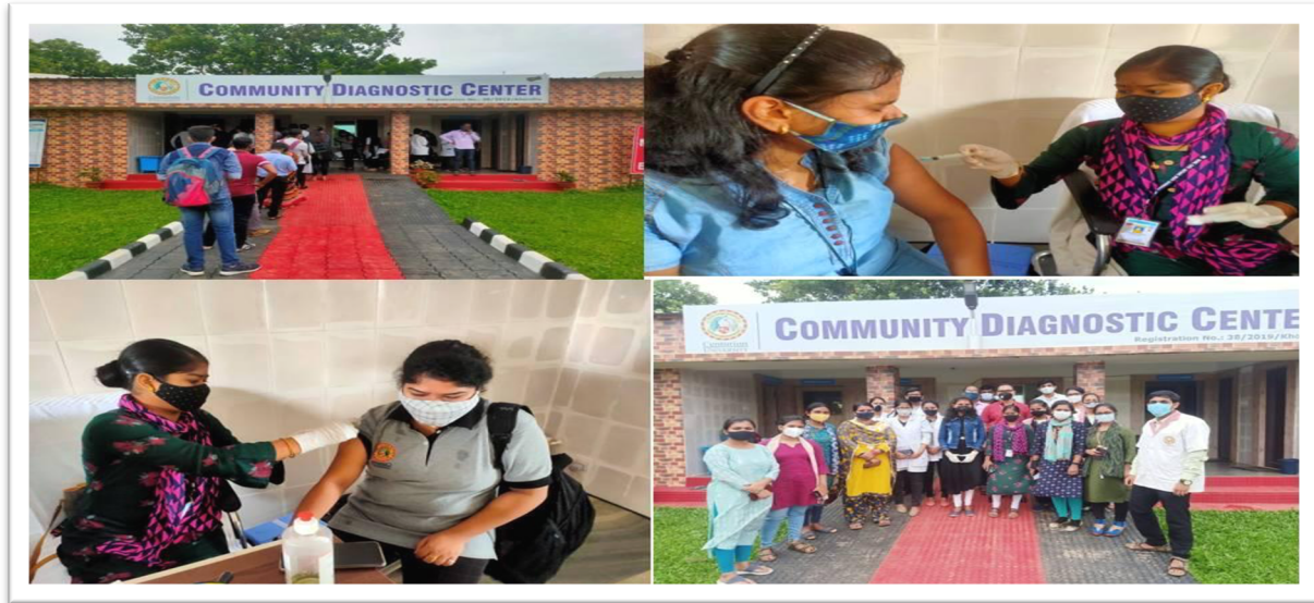
Vaccination Drive Program at Community Diagnostic Center