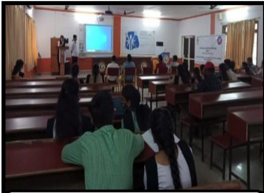
Students delivering oral