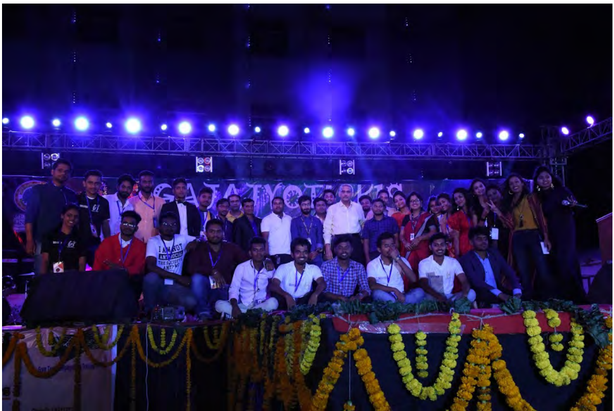
47)-International Women's Day:-