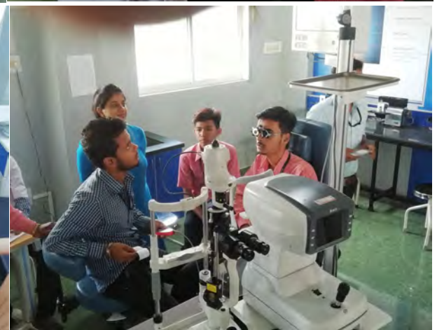
10) MADHUR MAYEE ADARSH SIKSHA NIKETAN: