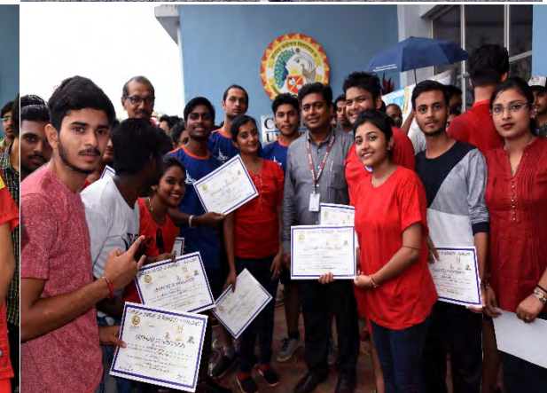
6) GANDHI JAYANTI: