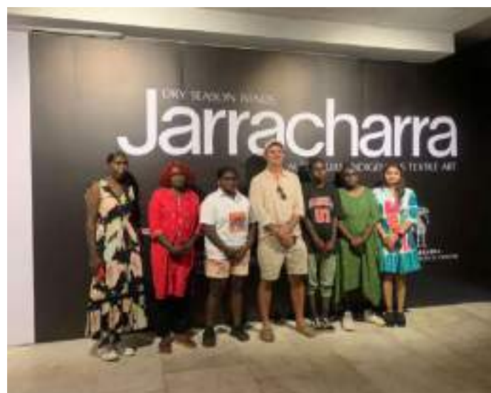
(In this photo she saw her grand mother in the exhibition)