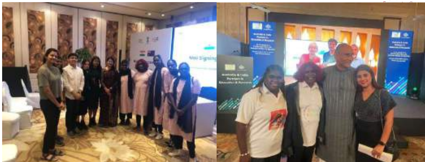
Visiting Jarracharra Exhibition of Traditional Textile Art in Delhi.