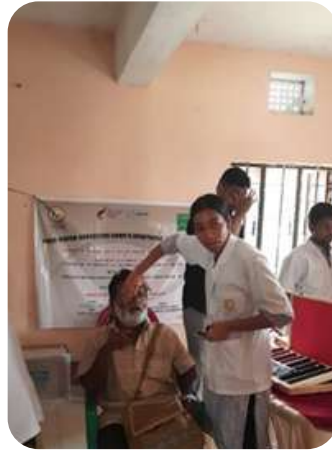
Capacity building of healthcare workforce in collaboration with various hospitals