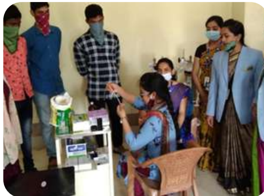
Health camp in collaboration with Centurion University and Viswass Nursing College

A health checkup program was also conducted by the Community Diagnostic Center, Centurion University at Viswass Nursing College, Khordha. The event witness's active participation of people from nearby localities to avail the free service.