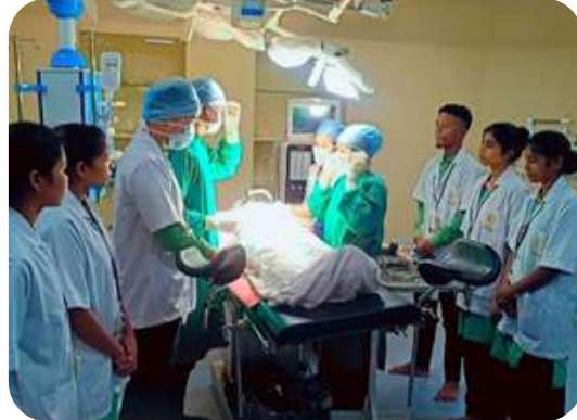
Training of students in Operation Theatre sector as a collaboration between Centurion University and NMDC

Centurion University has also collaborated with LTIMindtree to train 29 students from different underserved localities of Odisha in Phlebotomy technique.