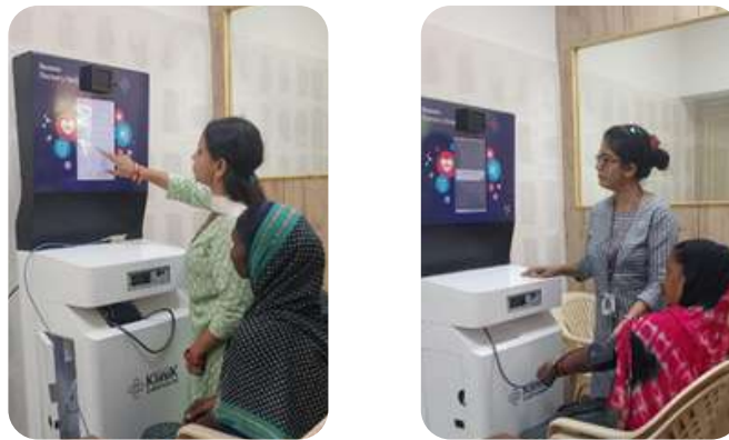
eHealth facility for the local community in Jatni

To facilitate people with better telemedicine and eHealth facilities, the University has collaborated with Klinik Everywhere Technologies Pvt. Ltd. Through this collaboration the University has set up portable digital kiosk machine across all its campuses. These machines are patient centric platforms enabling doctors to perform remote consultations on the go. The new age technique captures the patient's data and eases follow up check-ups as well. In the Academic year 2022-2023 at least 220 patients have benefitted from the collaboration.