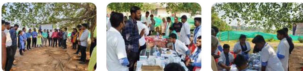
Free Drug Distribution Camp At SEVAK, CHHATIA, JAJPUR

On the 5th of November 2022, the School of Pharmacy and Life Sciences and the School of Paramedics and Allied Health Sciences, Centurion University collaborated to host a Free Drug Distribution Camp at SEVAK, Chhatia, Jajpur. This event aimed to provide pharmaceutical assistance to the residents of an Old Age Home and a Home for Specially Abled individuals, encompassing a total of 220 beneficiaries. The health screening and drug distribution camp was organized with the purpose of providing necessary health support to the residents of this organization. Centurion University made a generous contribution of ₹ 15,000/- to the SEVAK organization.