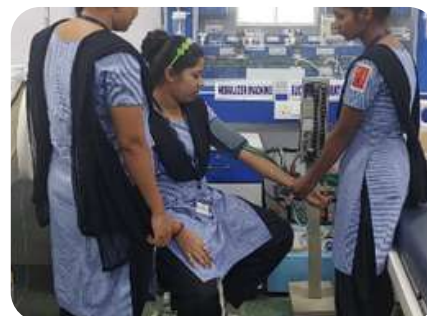
Training of students in Phlebotomy sector as a collaboration between Centurion University and LTIMindtree

The University also has collaborated with Essilor to conduct comprehensive eye examinations, and offer complimentary prescription eyeglasses to individuals holding Below Poverty Line (BPL) health