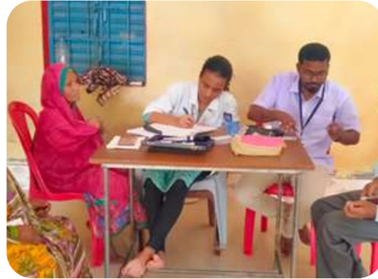
Free eye screening camp in initiation with Ruby Eye Hospital

A health checkup program was also conducted by the Community Diagnostic Center, Centurion University at Viswass Nursing College, Khordha. The event witness's active participation of people from nearby localities to avail the free service.