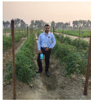
Tomato farming with staking