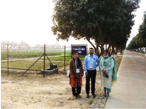
CUTM team visit to farm