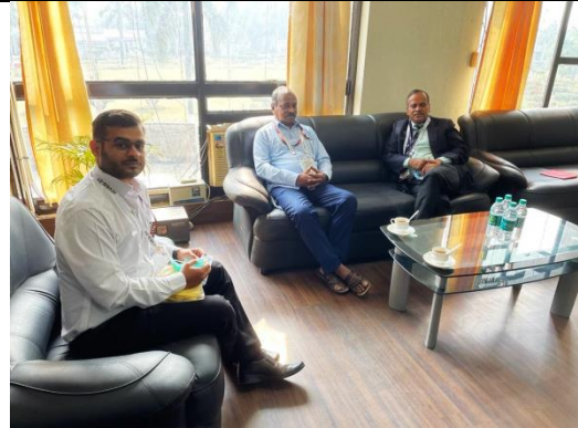
Interaction with Director IIVR