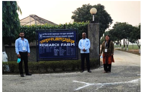
Visit to Research farm