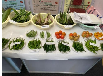
Kashi varieties Chilli, Tomato, Country bean