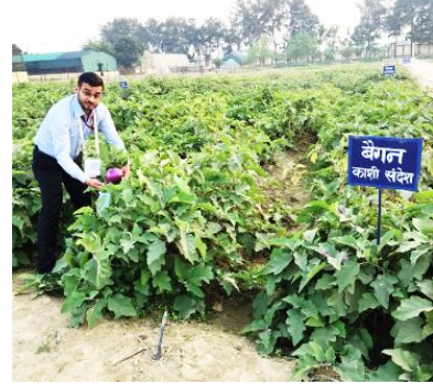
Kashi Sandesh in field