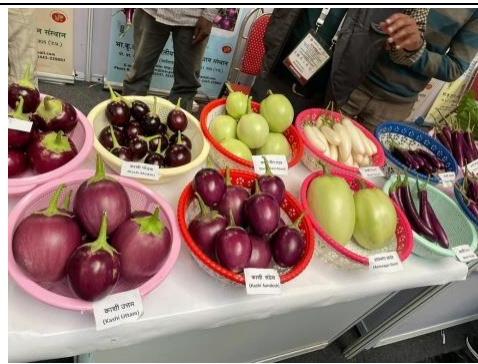
Kashi varieties brinjal