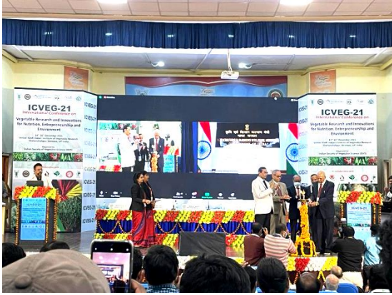
Inaugural programme of ICVEG-21