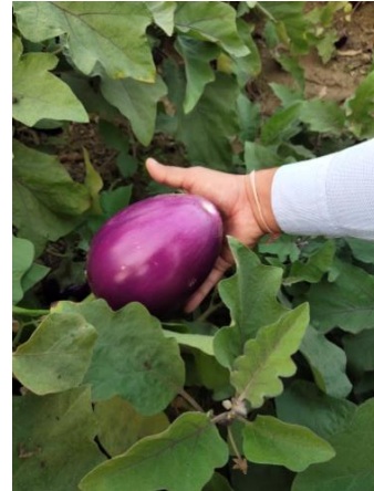
Kashi Uttam brinjal