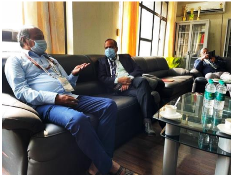
Interaction with Director IIVR