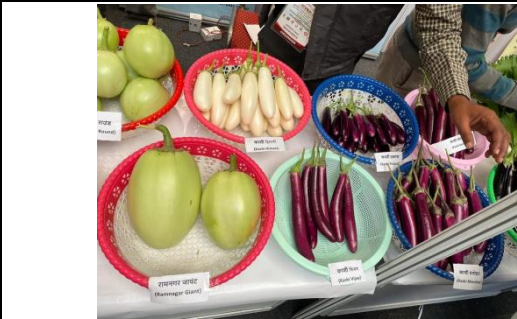
Kashi varieties brinjals