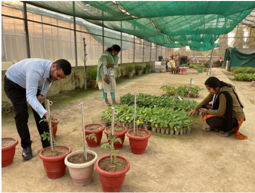
Polyhouse Brimato acclimatization