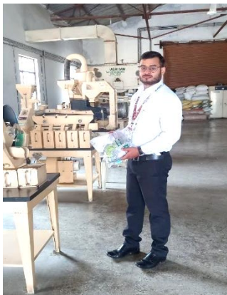
Visit to seed processing Unit inside IIVR