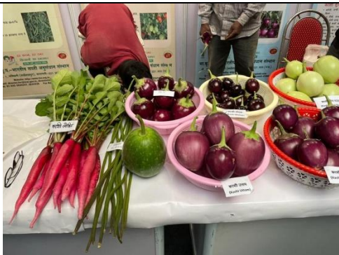
Kashi brinjals, Drumstick and radish