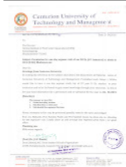
Permission letter-CUTM-CIFA.jpg 140K