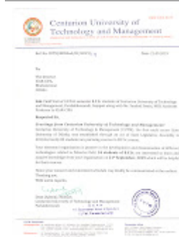
CUTM-Permission Letter for Field Visit-ICAR-CIFA.jpeg 526K