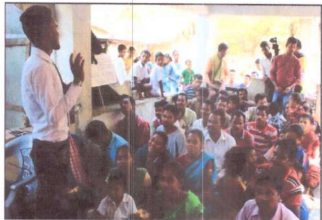
Community interaction by students