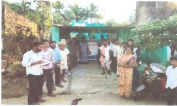
Training on Vermicompost