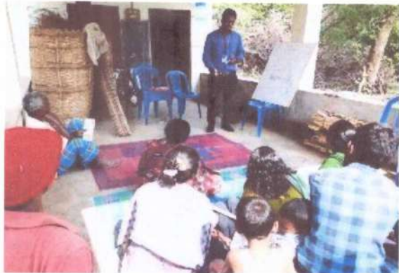
Training on Vermicompost