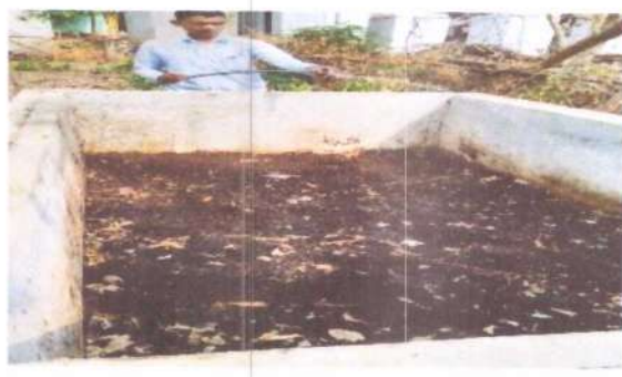
Installed Vermicompost Pit