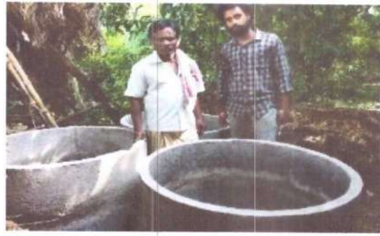
Installed Cement Ring