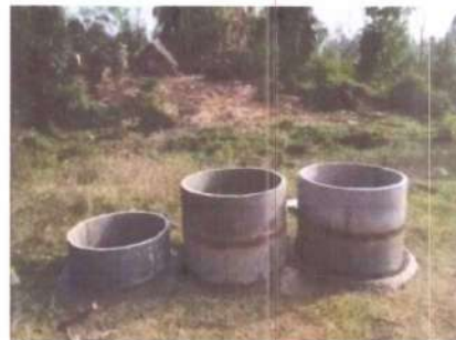
Installed Cement Ring