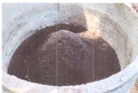
Installed Cement Ring