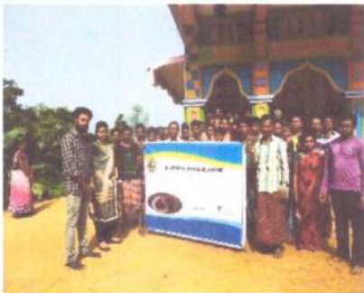
Training on Vermicompost