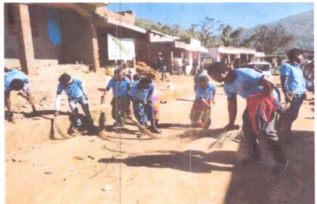
Students in action with the community