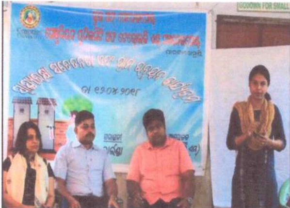
Meeting in presence of Govt. Medical staff