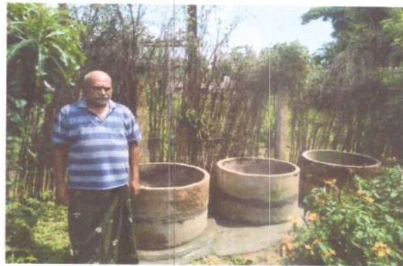
Installed Cement Ring