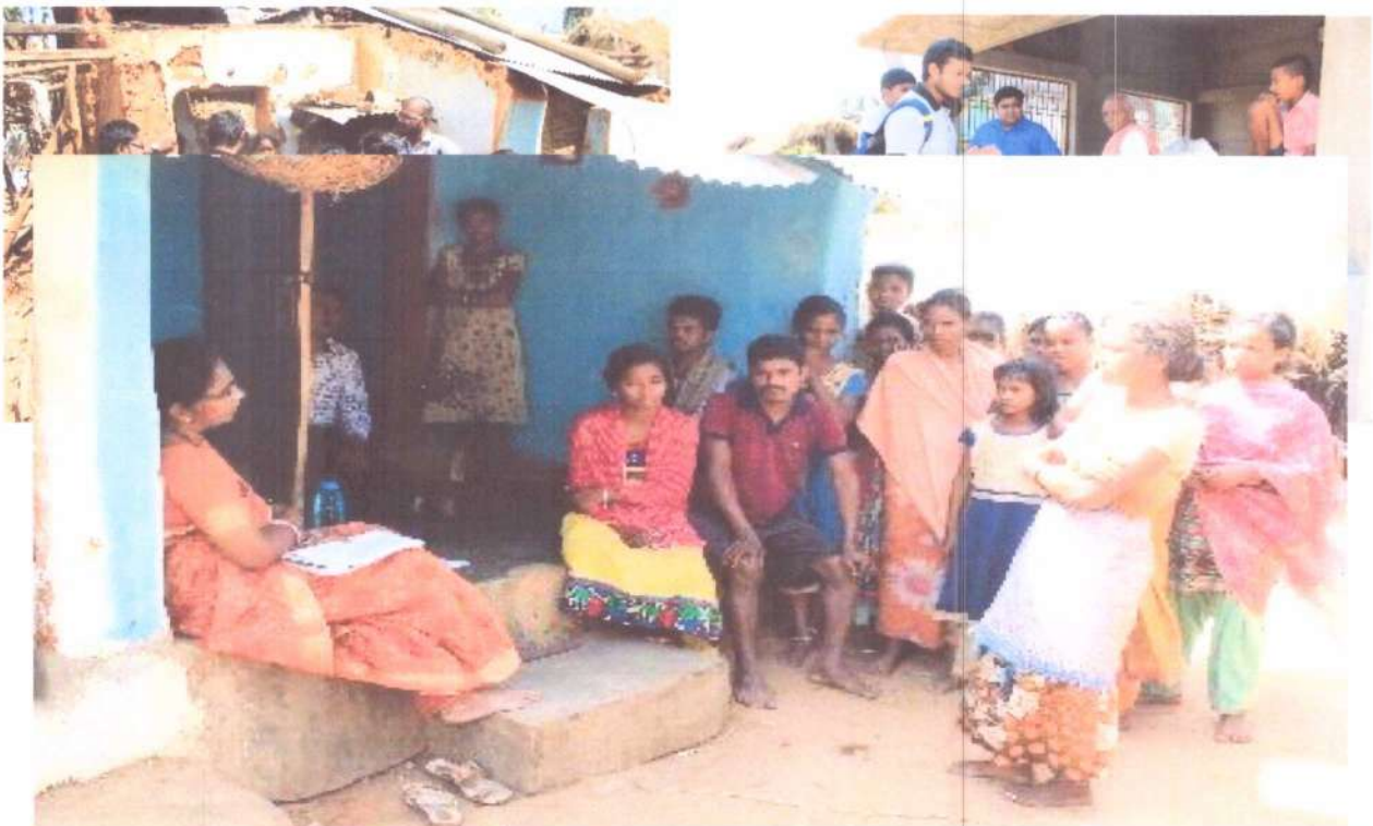
A team of students and staff from CUTM, Paralakhemundi campus came into action with a rapid assessment of the worst affected cyclone (Titli) hit areas, and the same was shared with the District Administration.