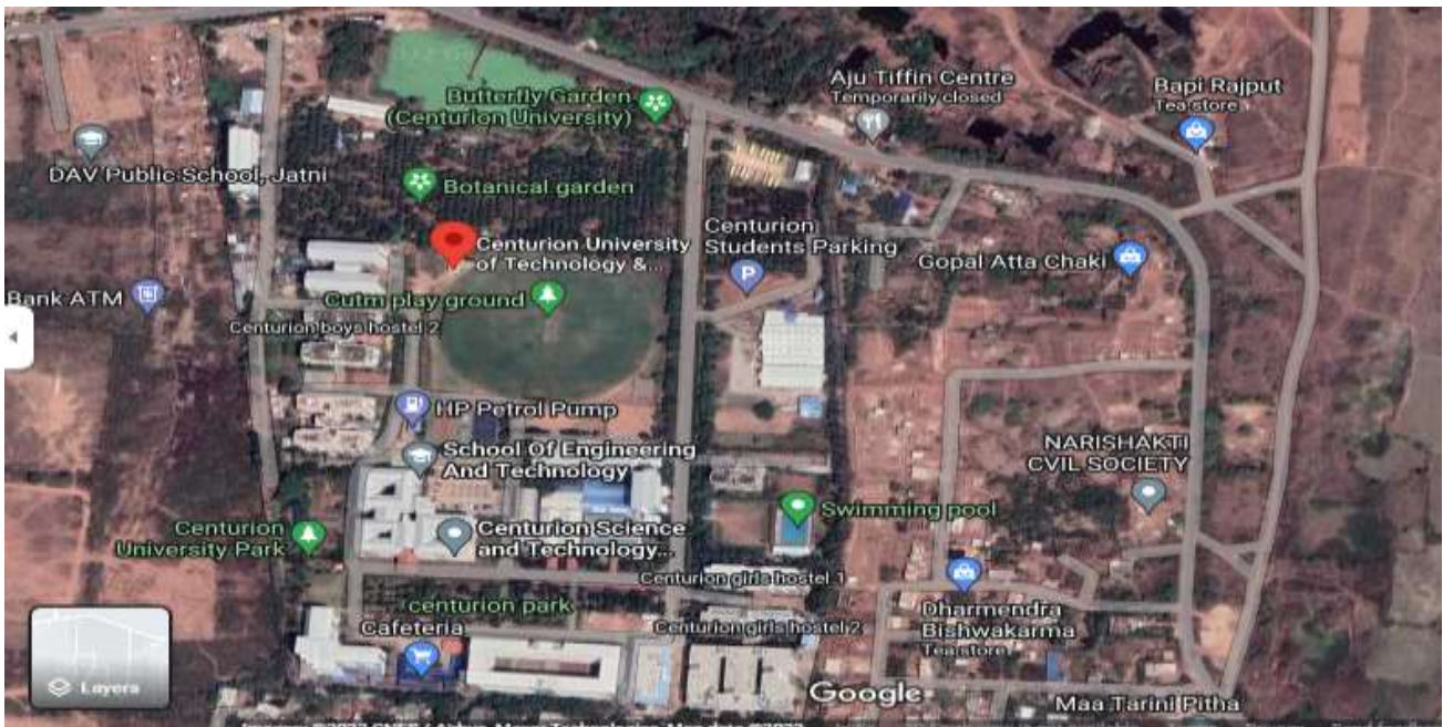
Figure: 1.1 - Image of Centurion University, Jatni Campus from Google map

Their vision was to build Centurion University brick by brick not only as a home for research and education but as an institution which provides opportunities for growth to all students from across the social canvas and they have succeeded in consolidating Centurion University as a truly remarkable place, with expertise across a wide range of disciplines and a superb academic atmosphere.