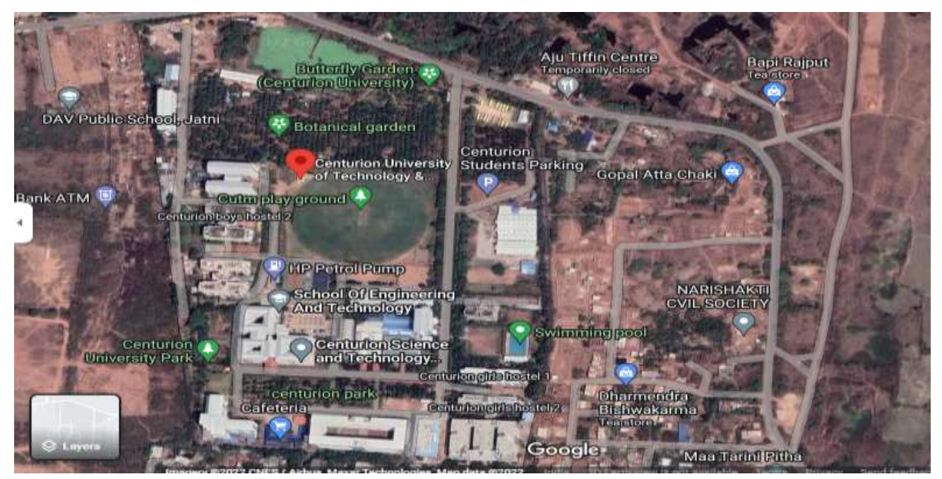
Figure: 1.1 - Image of Centurion University, Jatni Campus from Google map

Their vision was to build Centurion University brick by brick not only as a home for research and education but as an institution which provides opportunities for growth to all students from across the social canvas and they have succeeded in consolidating Centurion University as a truly remarkable place, with expertise across a wide range of disciplines and a superb academic atmosphere.