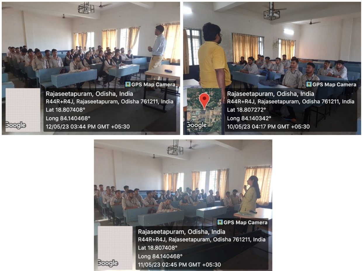
Fig: Technical subjects' discussion for placement interview