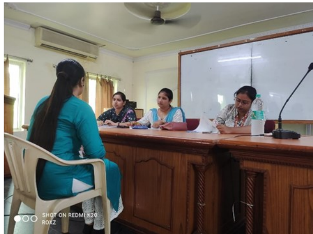
Fig: One to one mock interview for upcoming placement