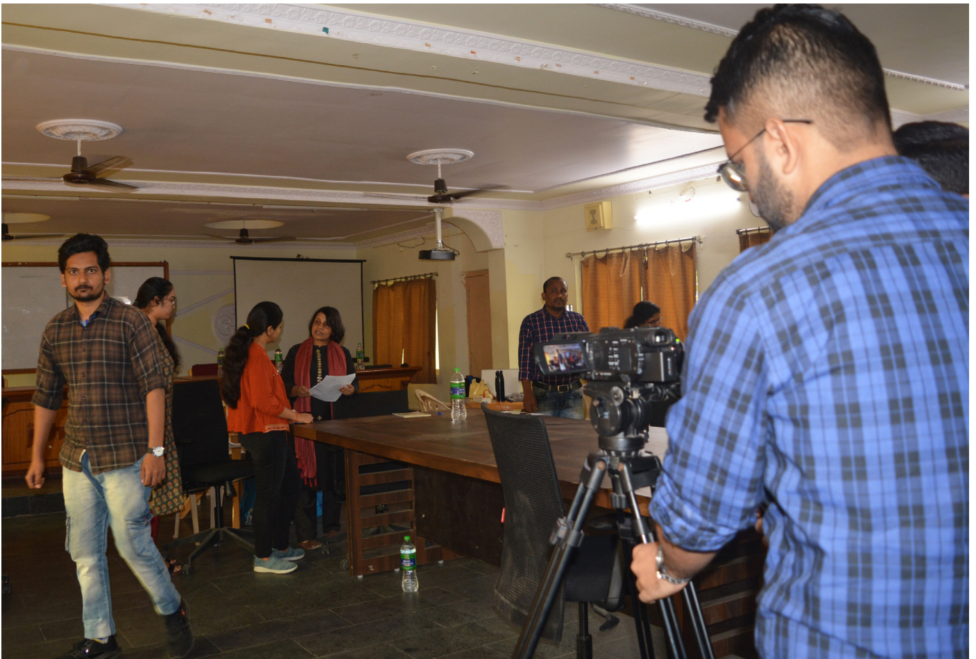
(Session on Camera Operation)