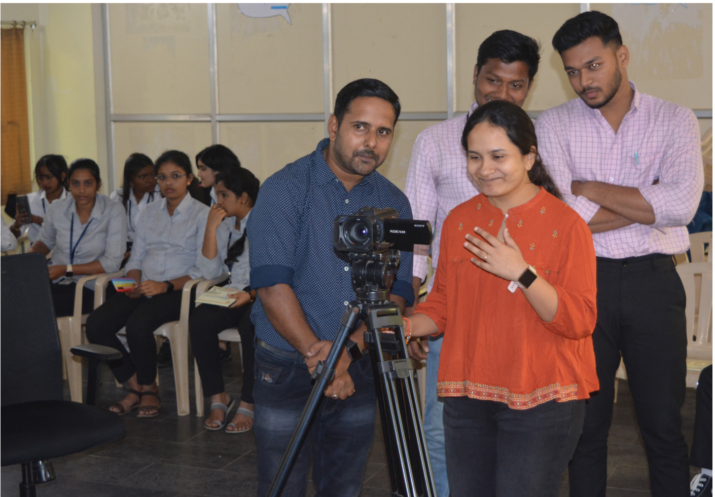
(Session on Camera Operation)