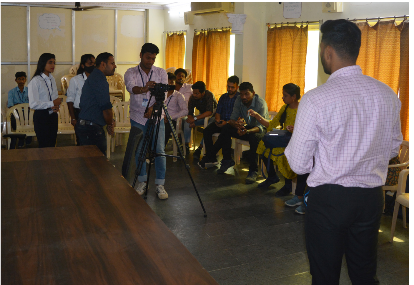
(Session on Camera Operation)