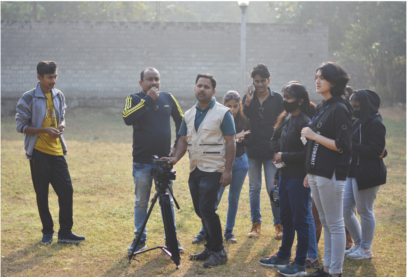
(Video Shooting of Tribal Village)