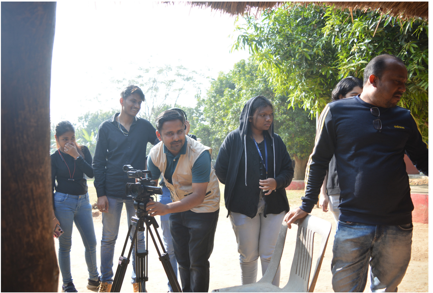
(Video Shooting of Tribal Village)