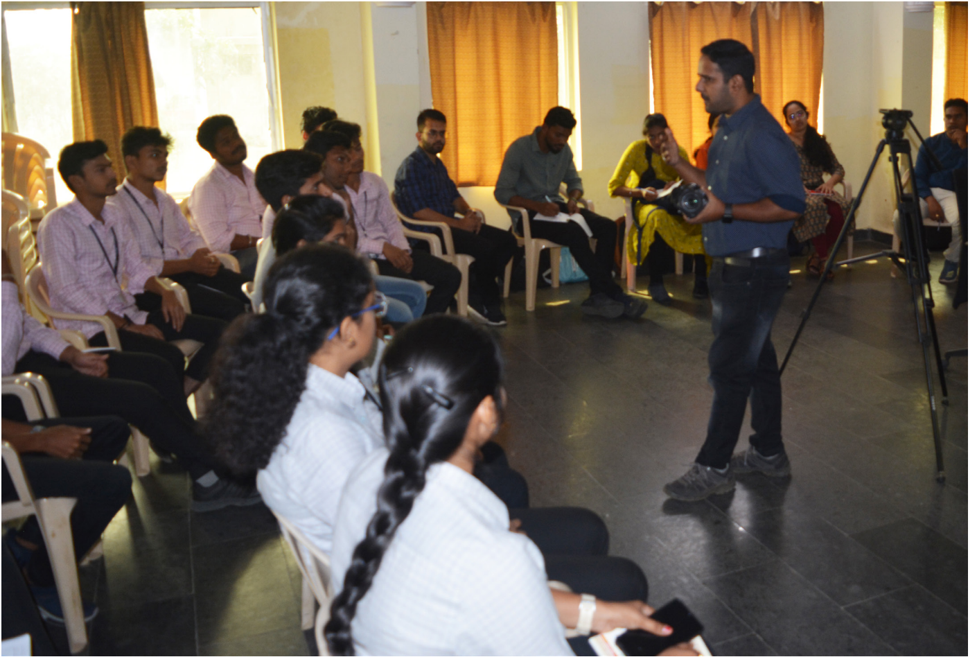
(Explain the Different Angle Shots)