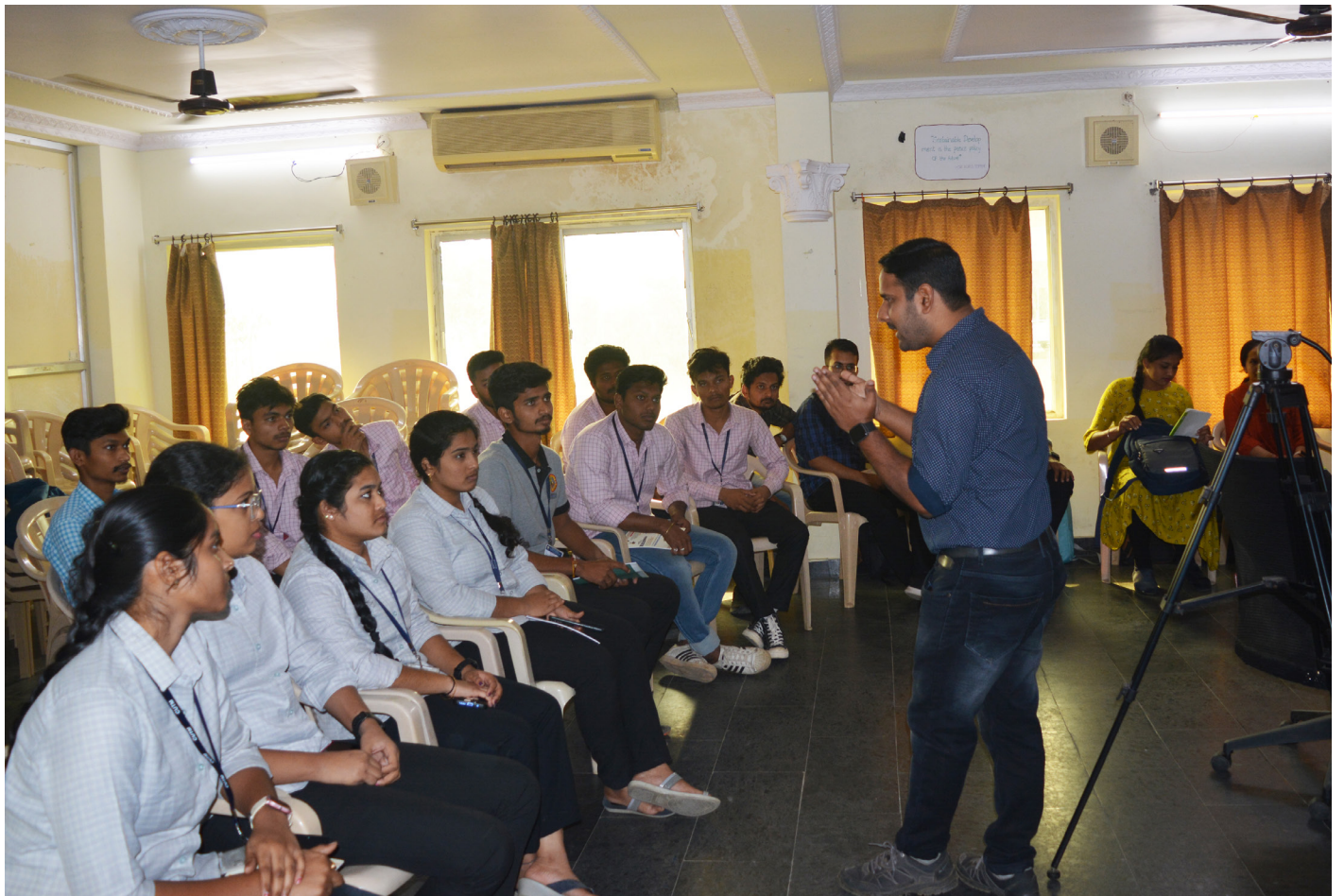
(Explain the Different Angle Shots)