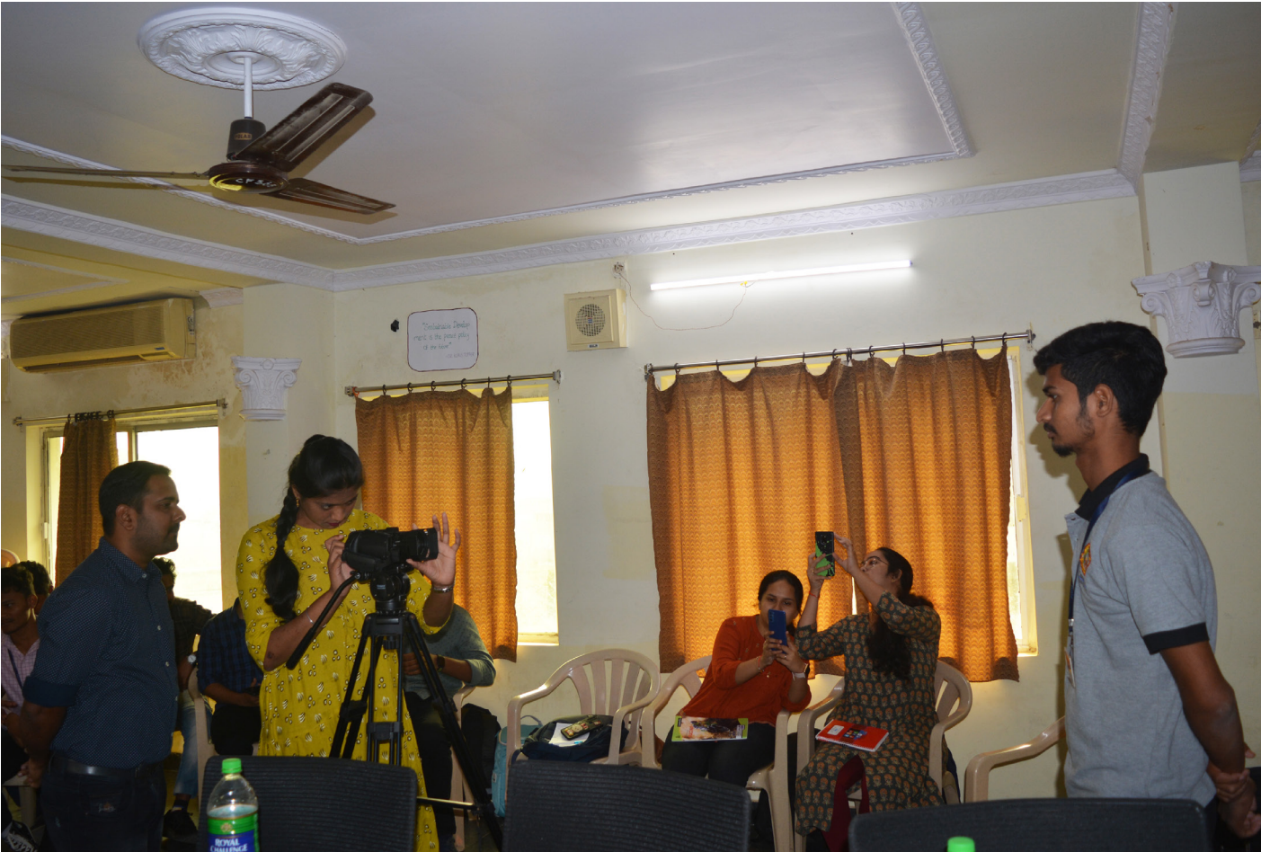
(Session on Camera Operation)