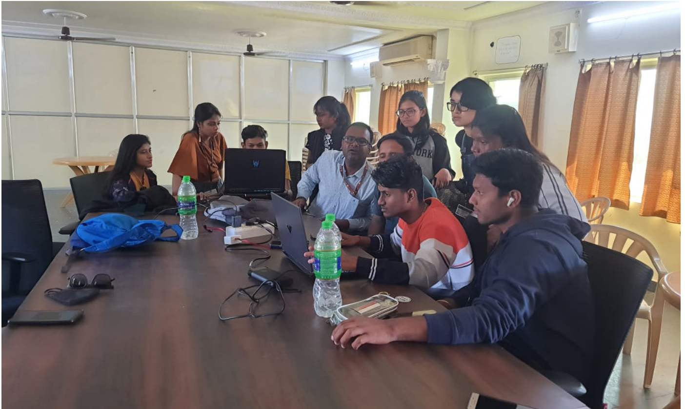
(A session on Editing)