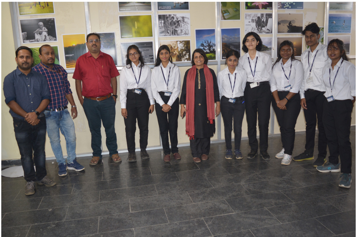
(Exhibition Participant and Faculty)