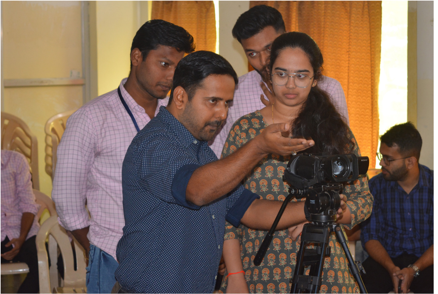
(Describe the Camera Angles)