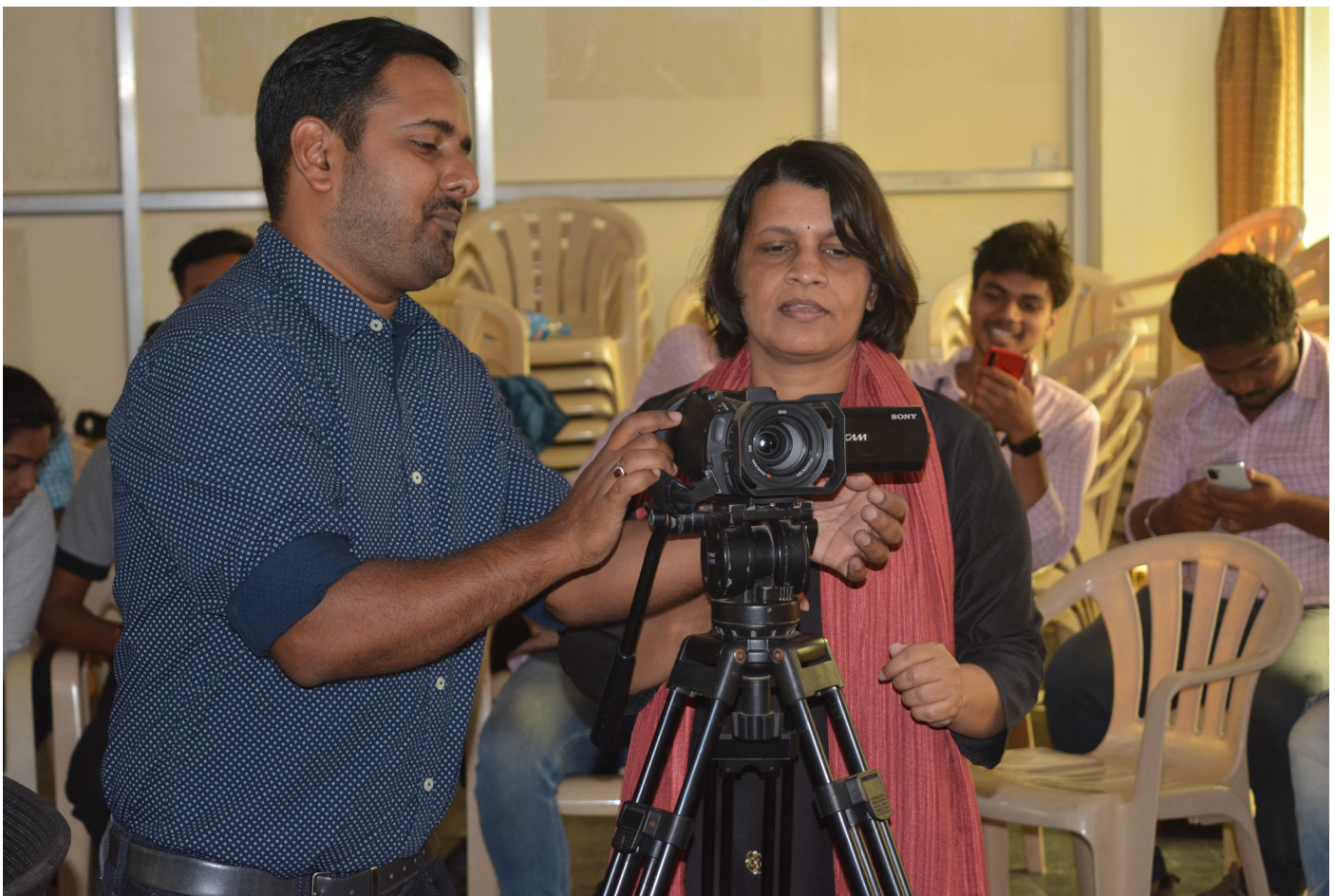
(Session on Camera Operation)