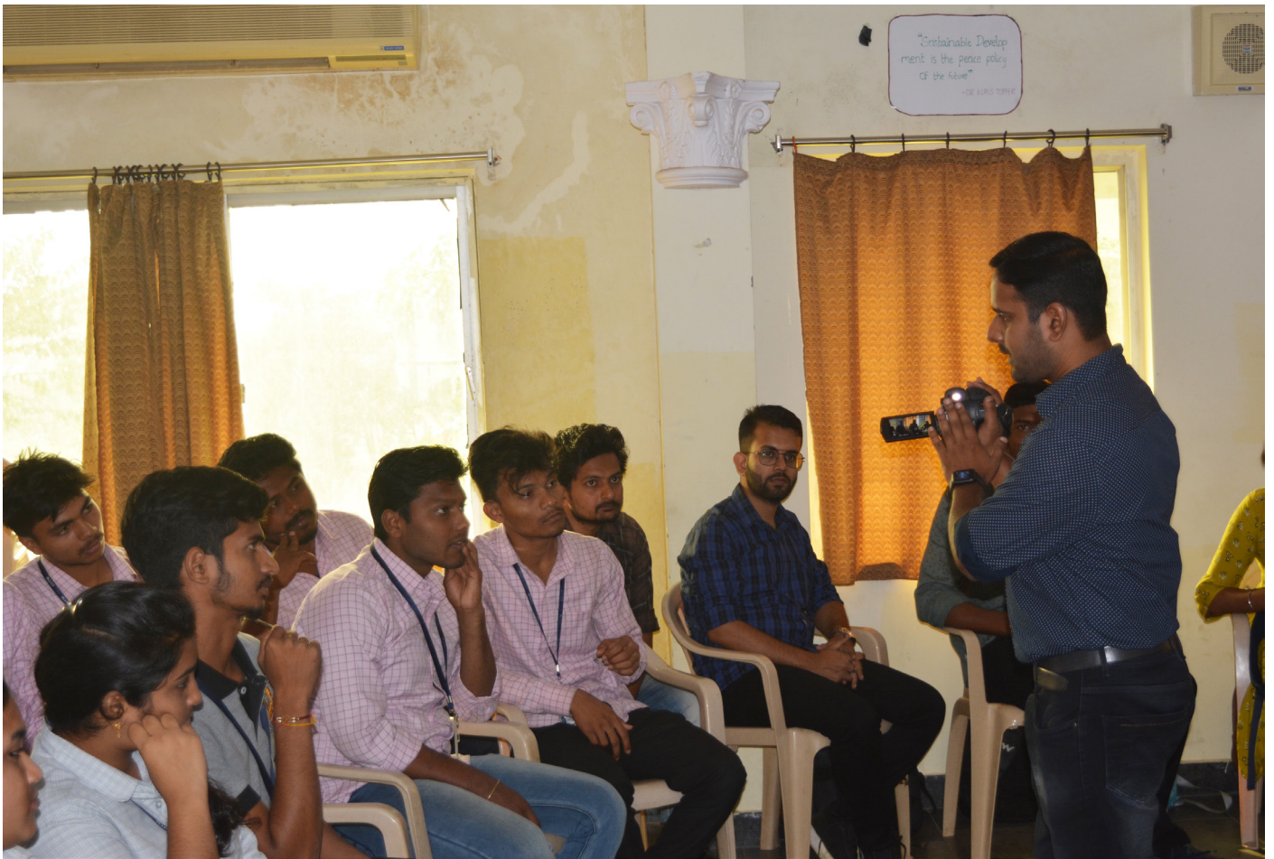
(Session on Camera Operation)