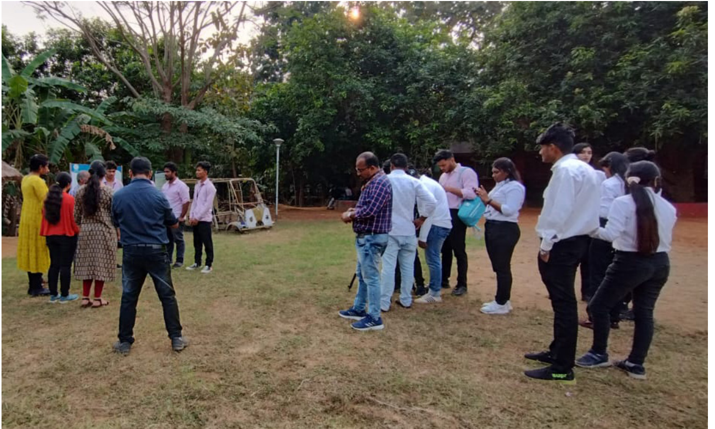
(Explain the location)