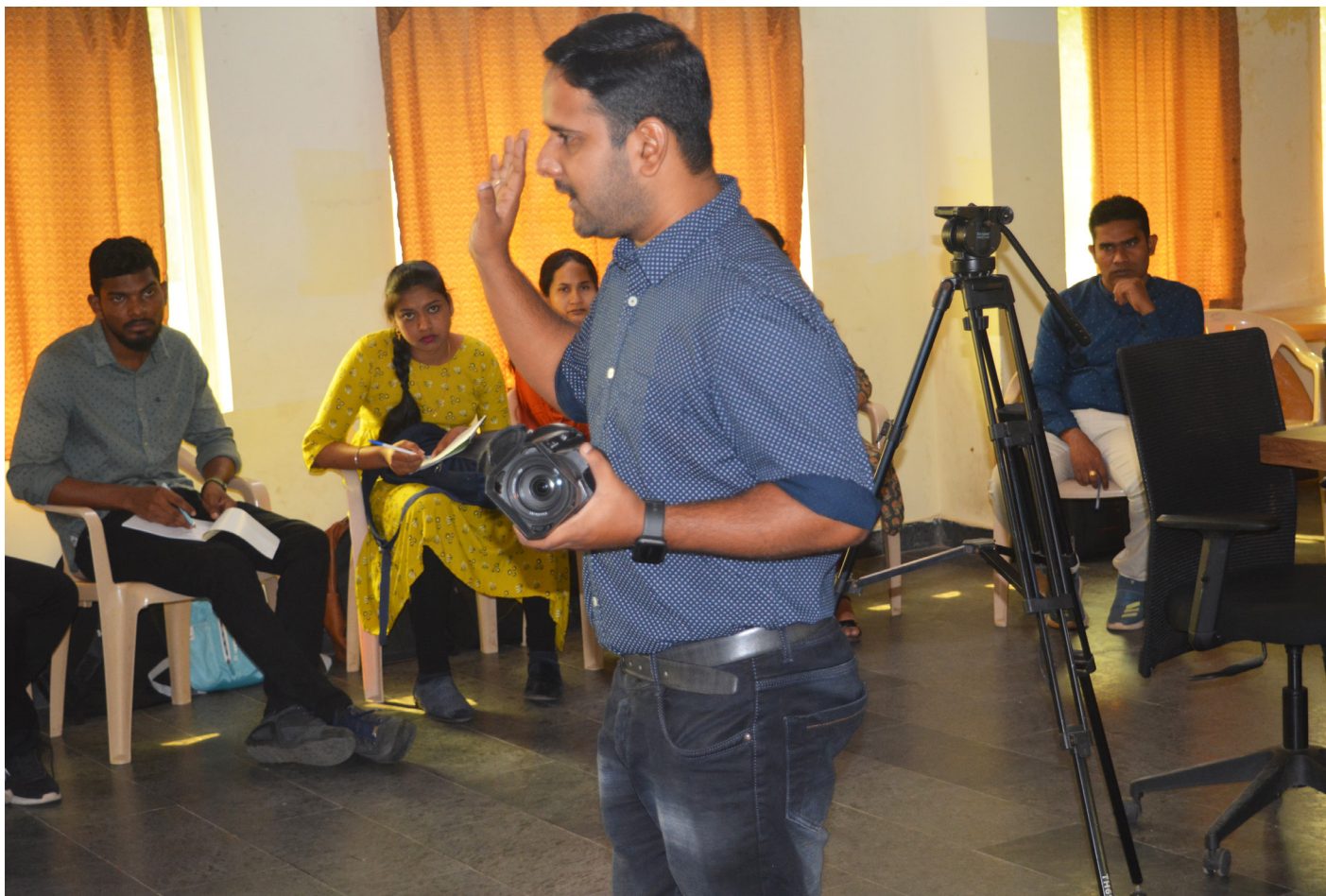
(Explain the different Angle Shots)