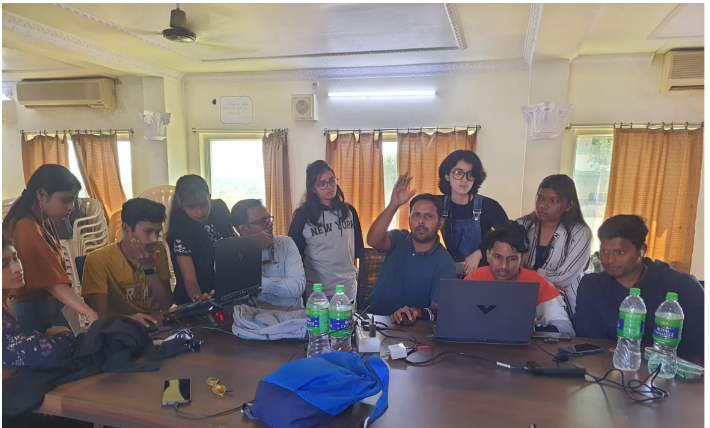
(A session on Editing)