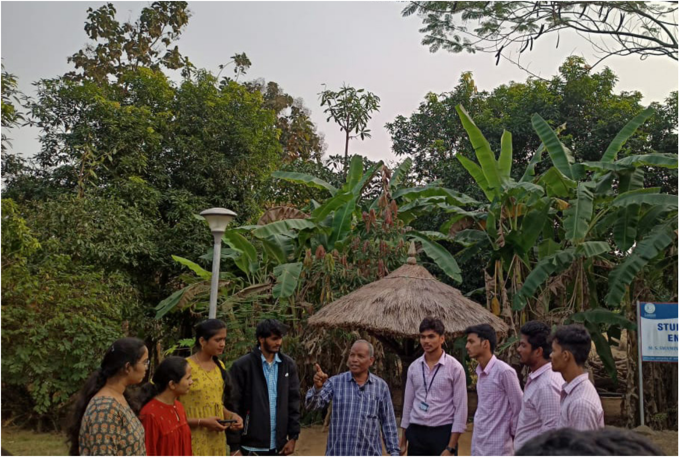
(Explain the location)