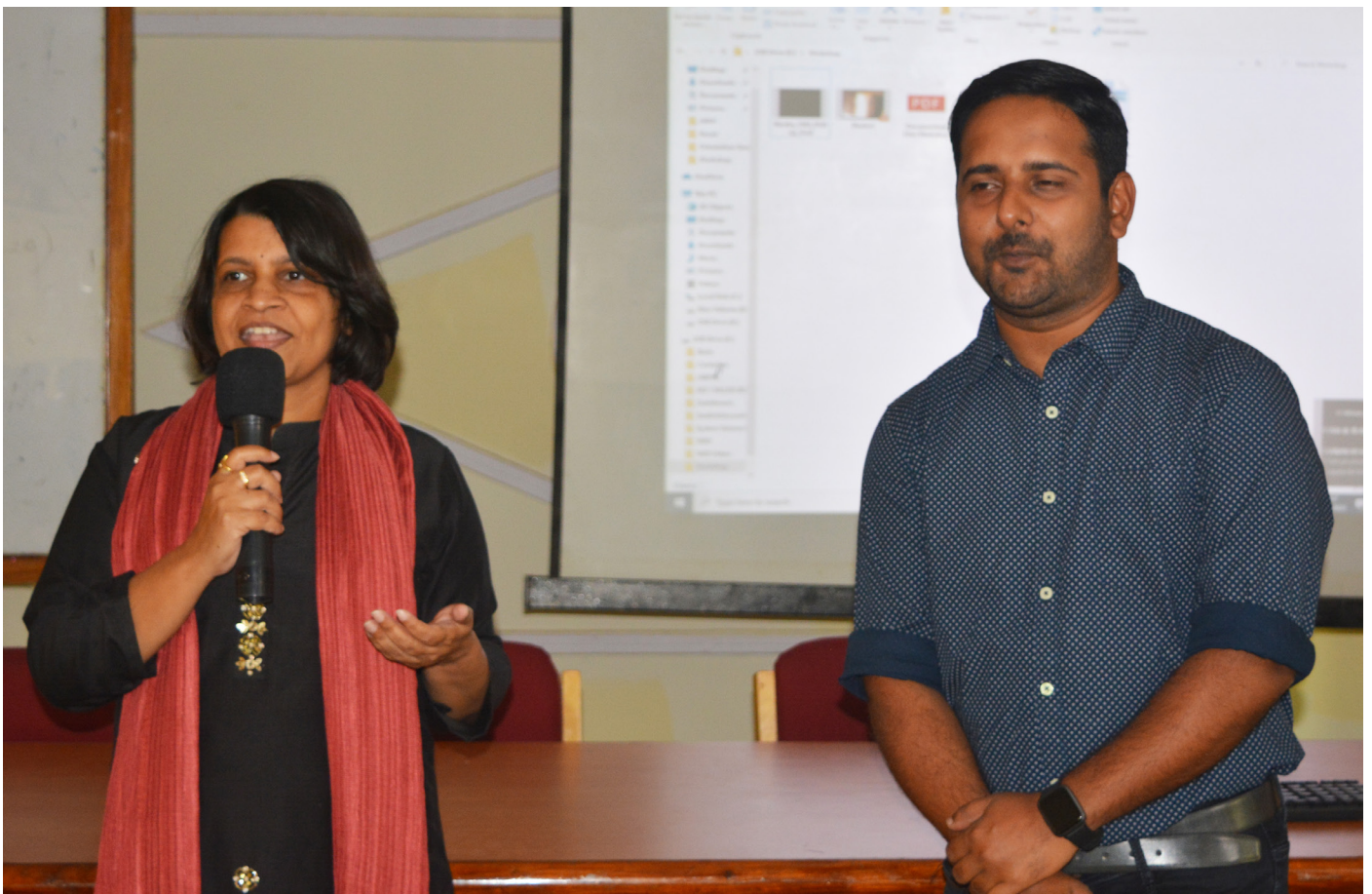
(Introducing the Resource Person)