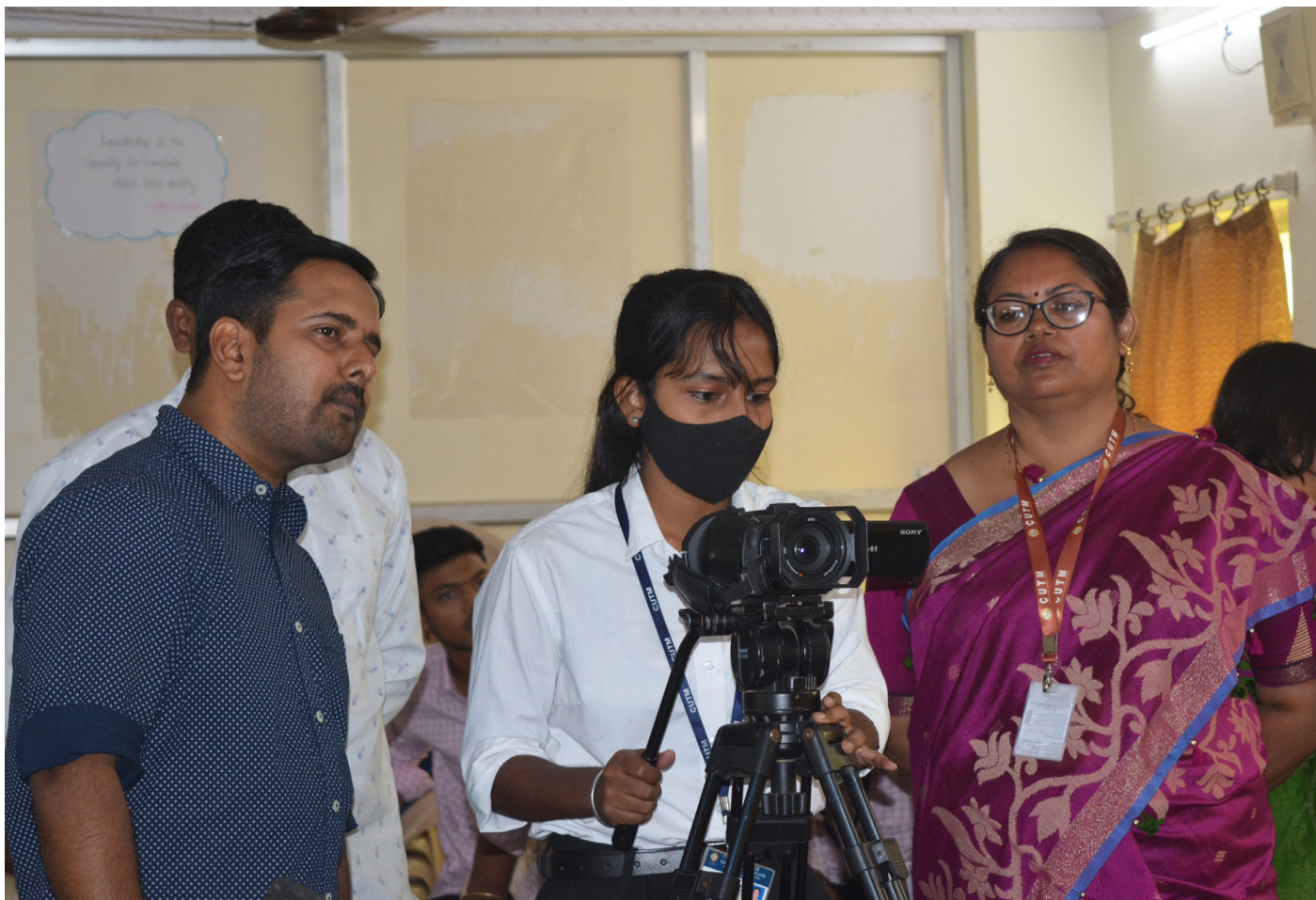
(Training on how to Handle the Video Camera)