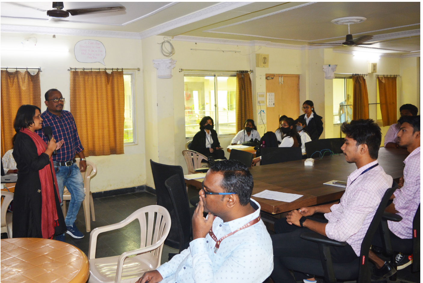
(Describing the purpose of the workshop)