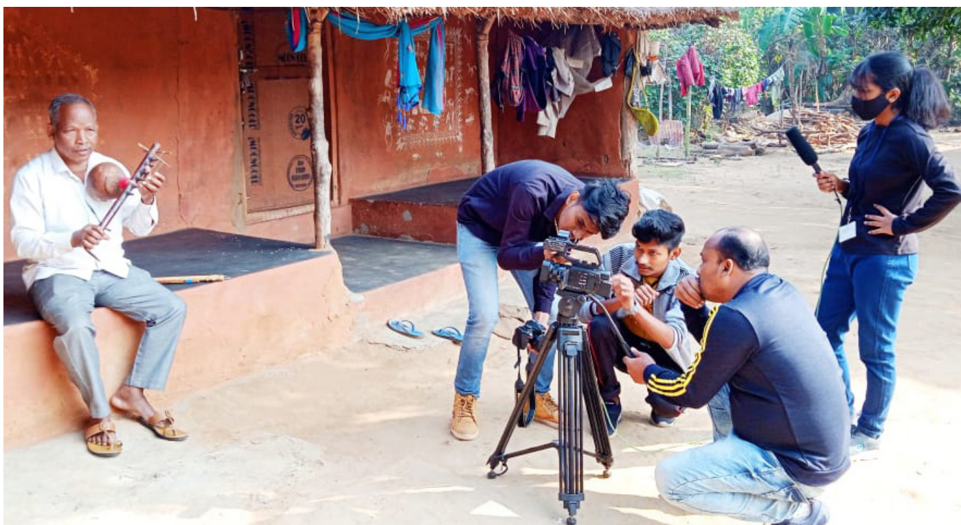
(Video Shooting of Tribal Village)