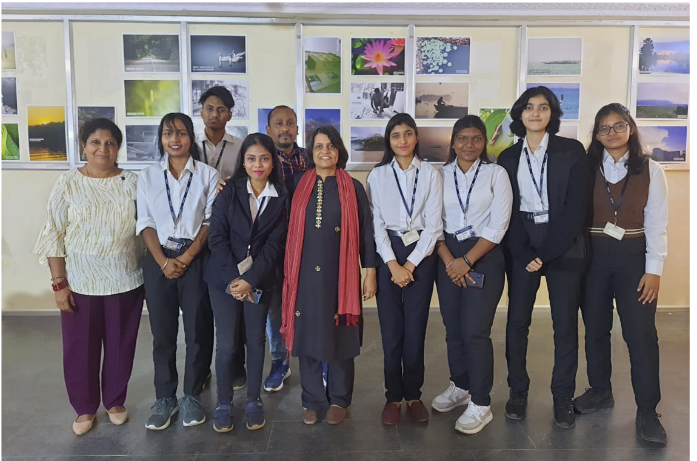
(Exhibition Participant and Faculty)