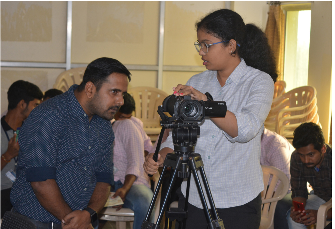
(Describe the Camera Angles)