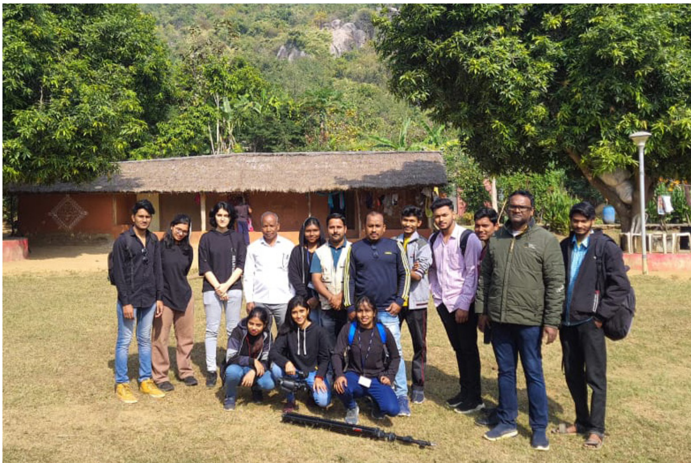
(Group Activity in Tribal Village)