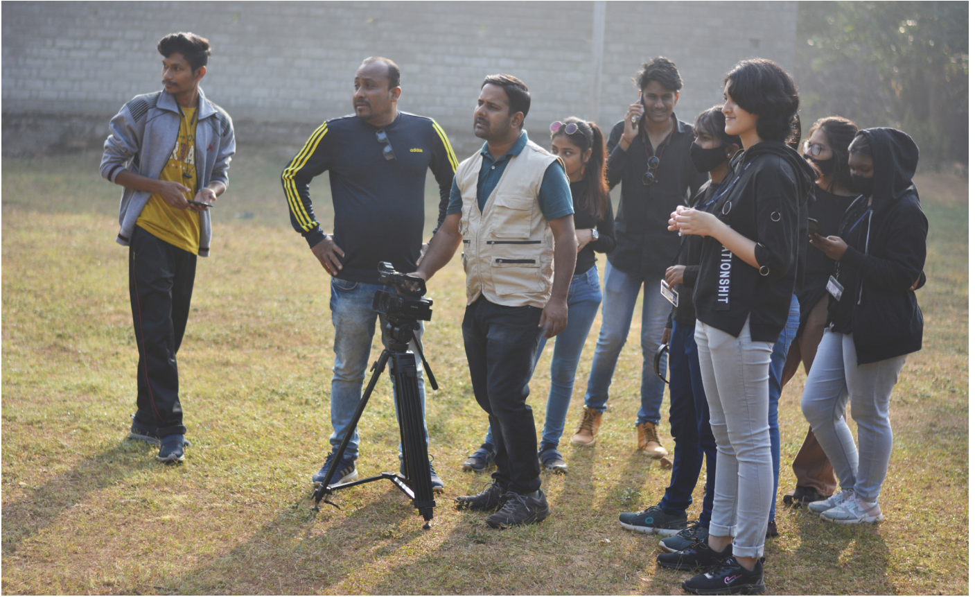
(Video Shooting of Tribal Village)