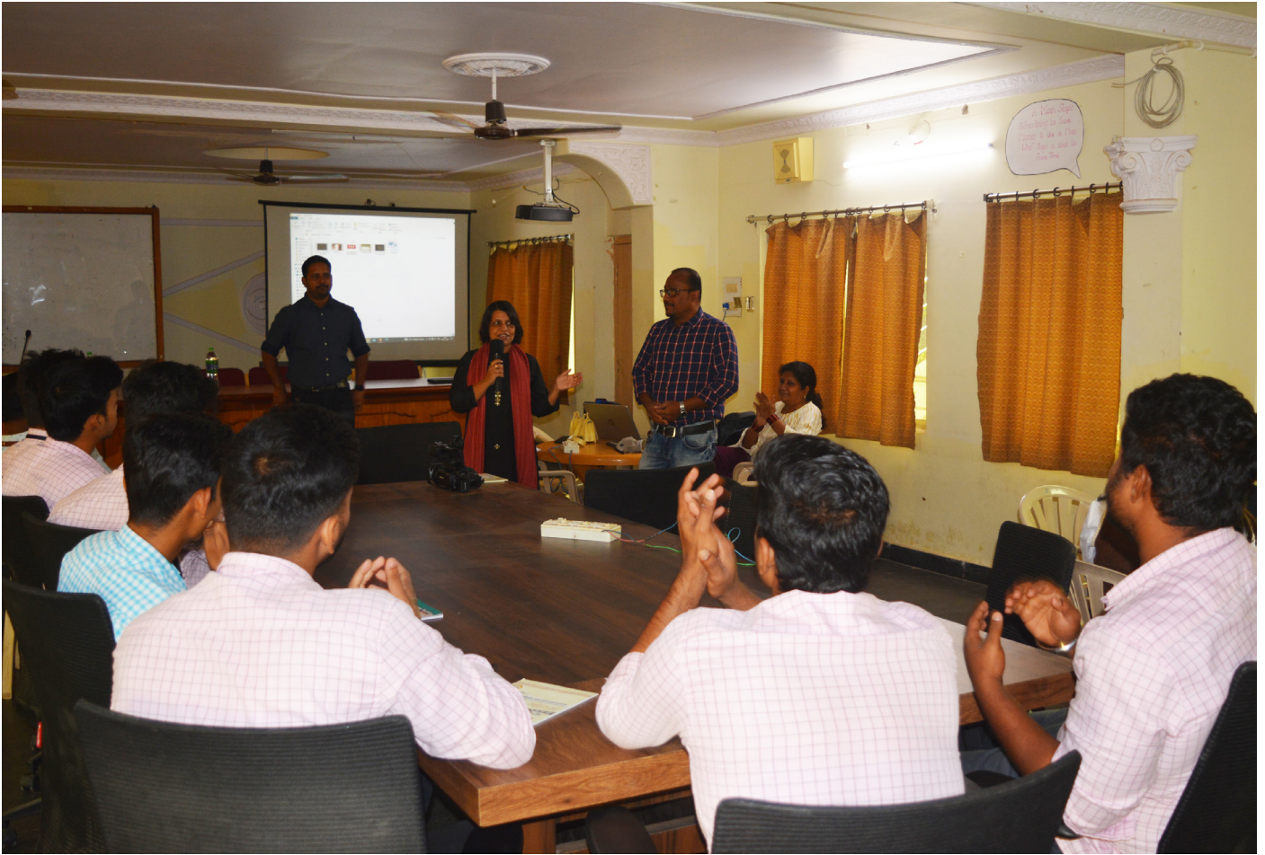
(Introducing the Organizer)