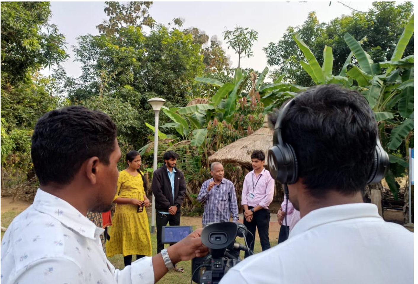
(Video Shooting of Tribal Village)