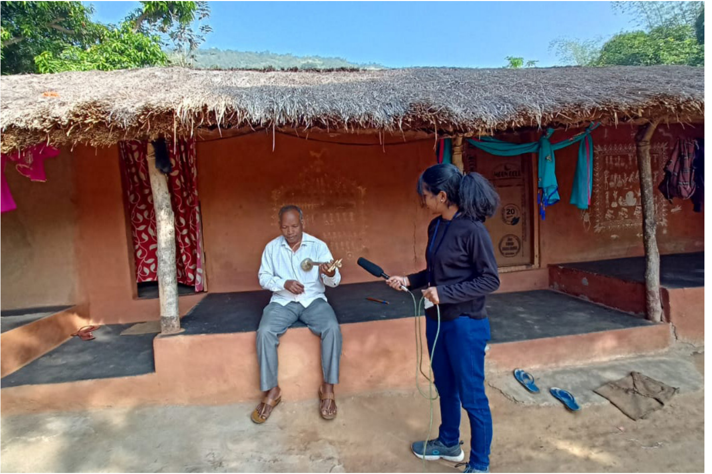
(Explain the location)