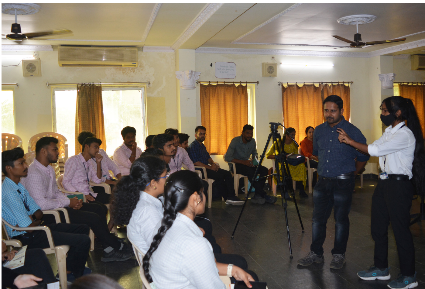
(Explain the Different Angle Shots)