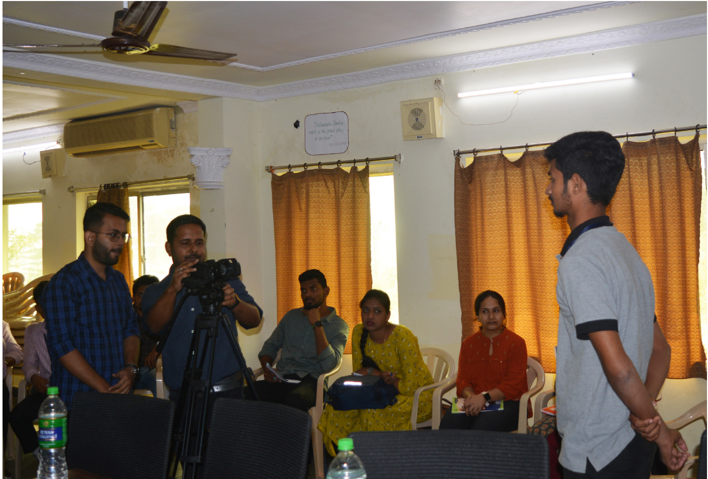
(Session on Camera Operation)