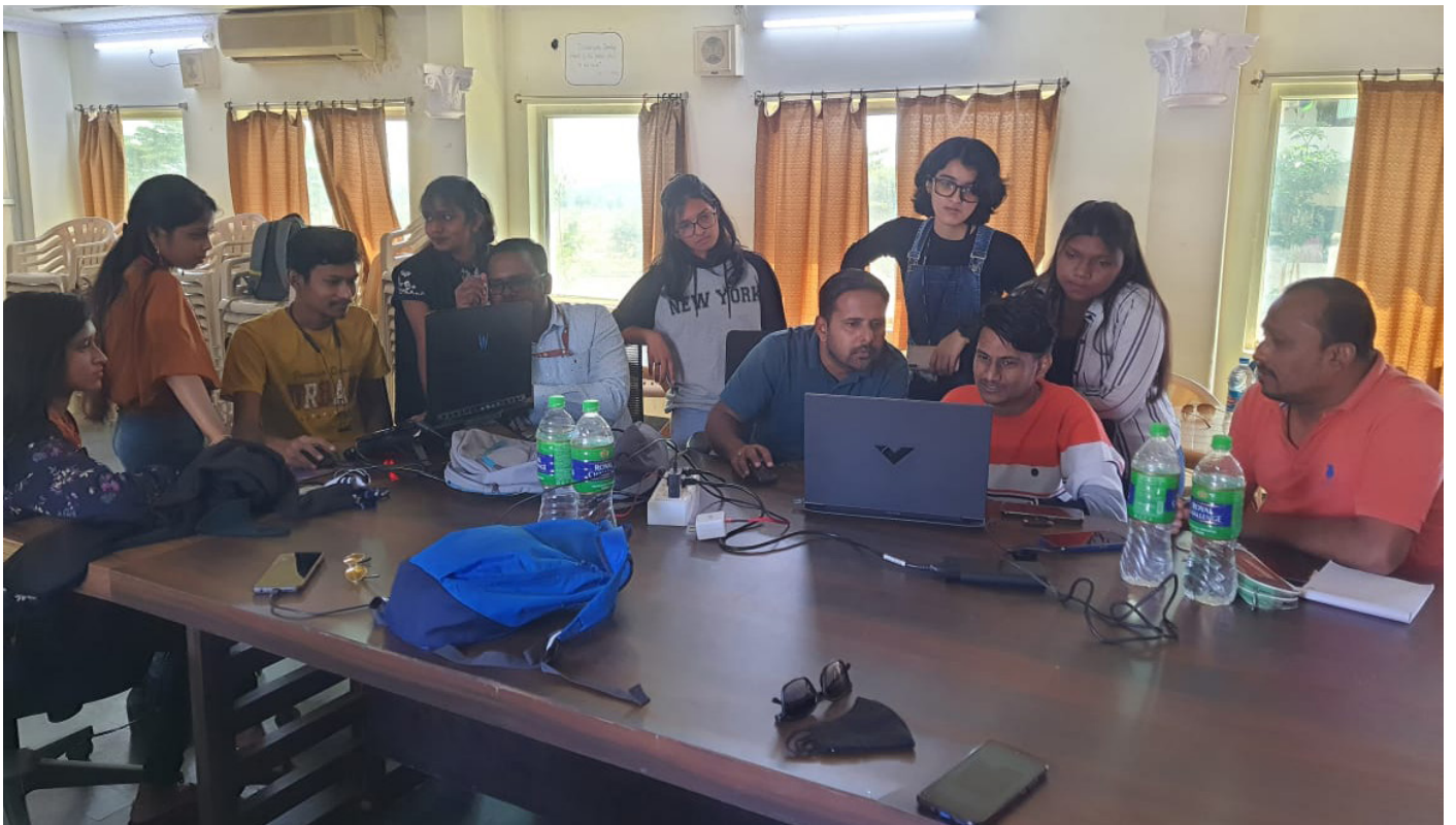
(A session on Editing)