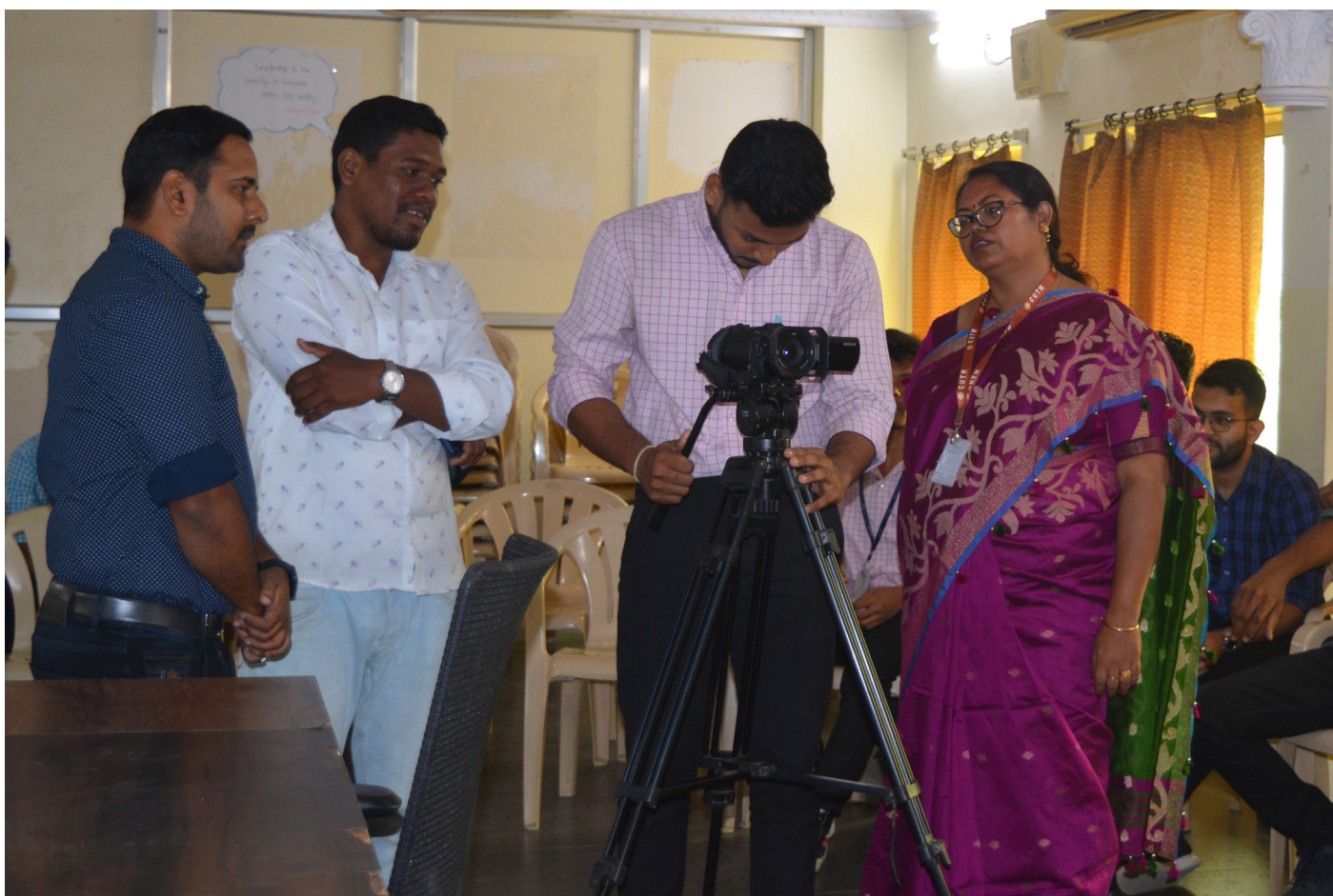
(Session on Camera Operation)