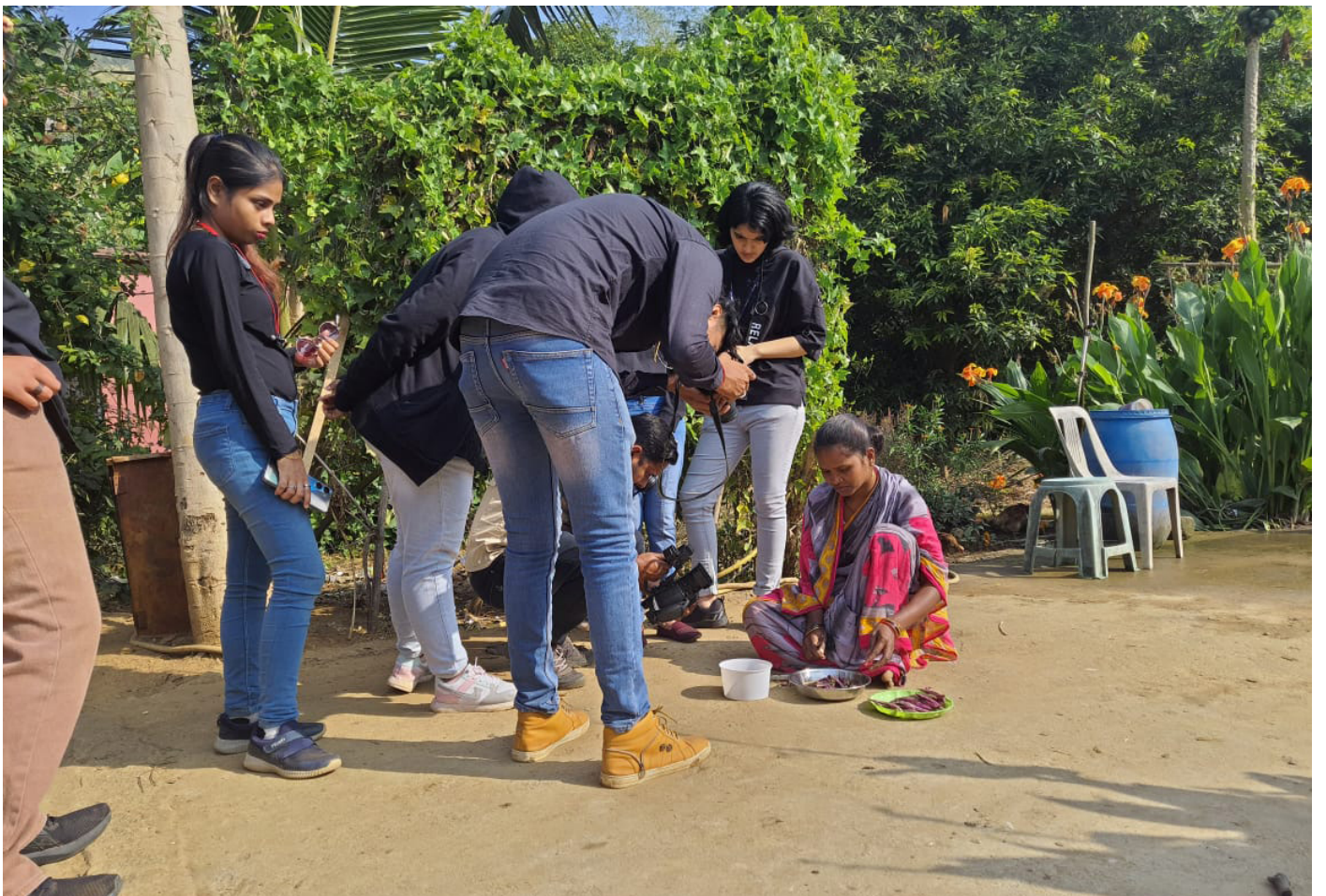
(Video Shooting of Tribal Village)