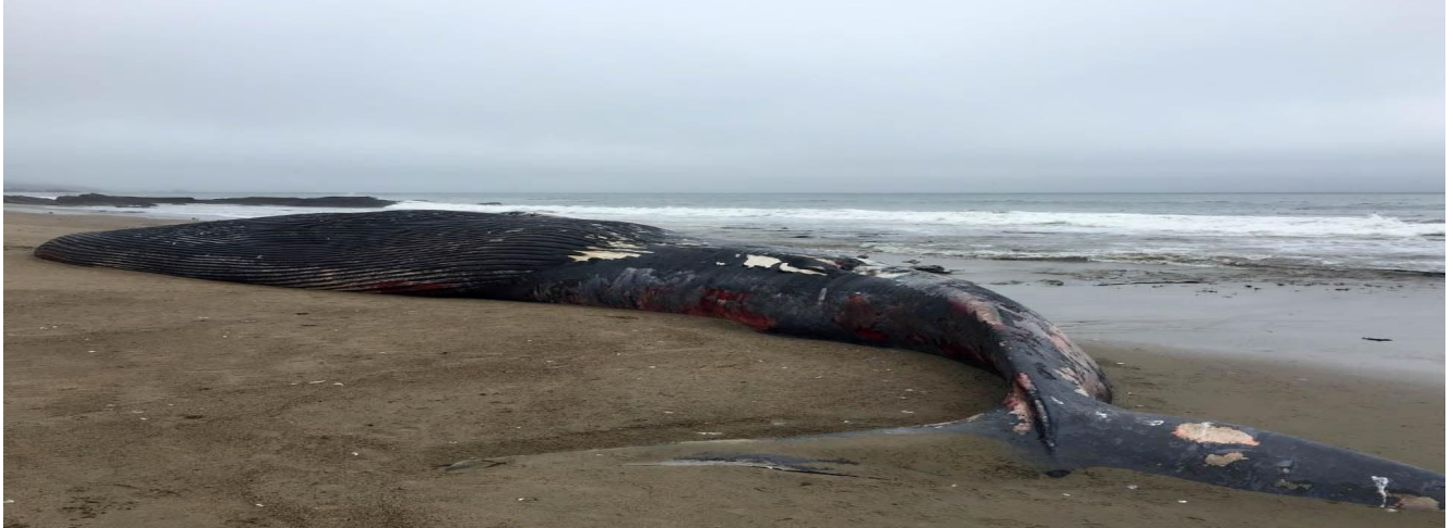
2. Blue whale