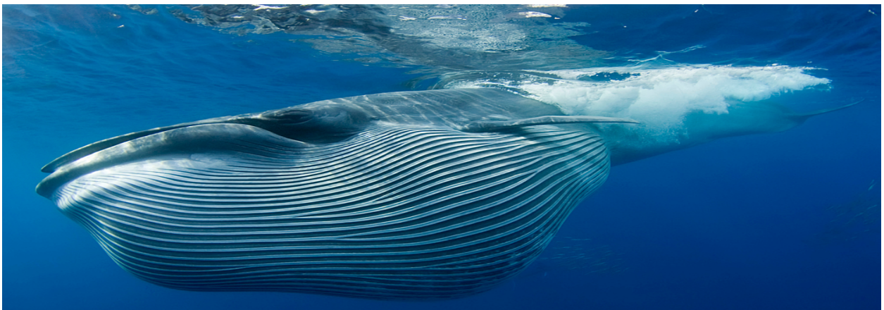
1. Brydes's whale