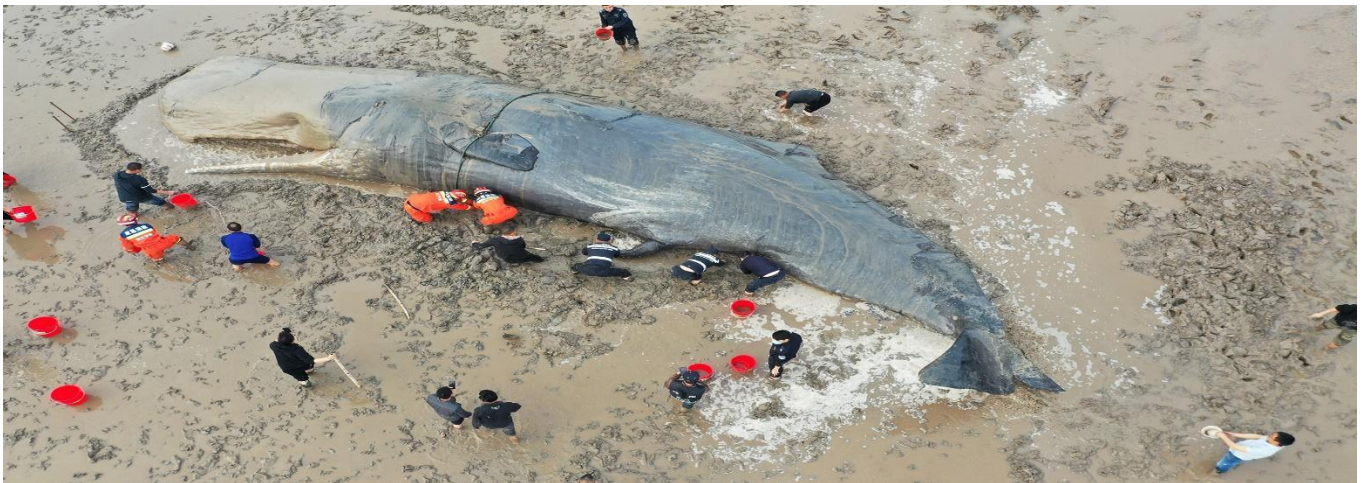
1. Sperm whale