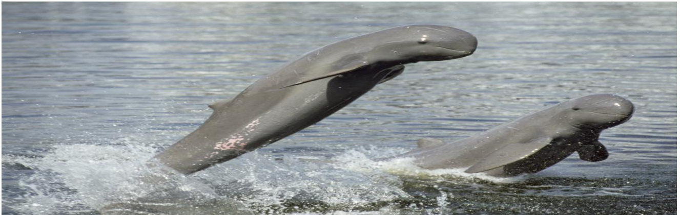
3. Irrawady dolphin