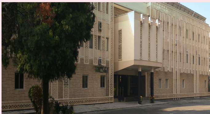
Indian Institute of Remote Sensing, Indian Space Research Organisation Department of space, Government of India 4, Kalidas Road, Dehradun -248001 (India) www.iirs.gov.in

ISRO's Disaster Management Support (DMS) programme has been actively supporting the central and state governments by providing operational services during pre-disaster, post-disaster time frames, including experimental forecasts, using space systems. Capacity Building (CB) in space technology for disaster management under ISRO DMS programme has been identified as a key element to motivate the participants to develop innovative methods, tools, data products, and services in the field of disaster management using space technology. DMS- CB programme is one such unique effort funded by ISRO initiated to fulfil the CB requirements in the country.