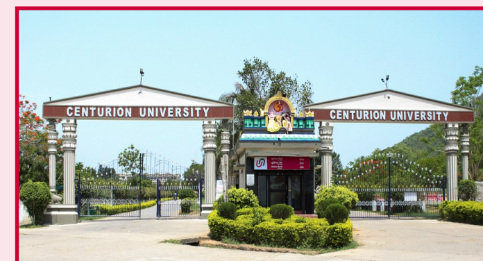
Centurion University of Technology & Management, Paralakhemundi, Odisha Village Alluri Nagar, R. Sitapur, Uppalada Paralakhemundi, Gajapati Dist, Odisha. 761211, India www.cutm.ac.in