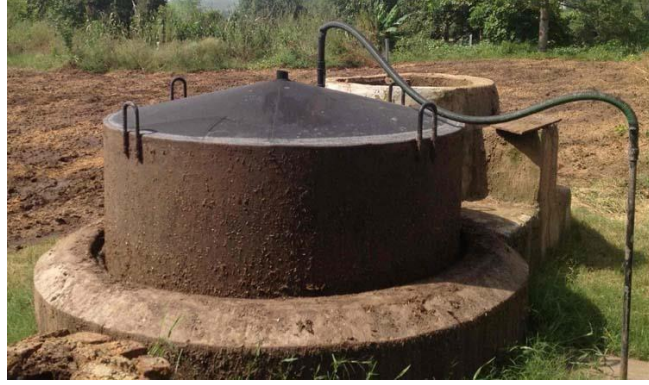
Fig: Food waste and cow dung digester (Biogas plant) for generation Biogas in tribal village, CUTM