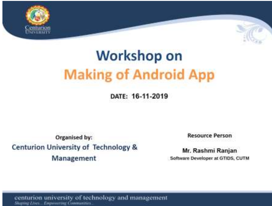
Figure: Brochure of the workshop