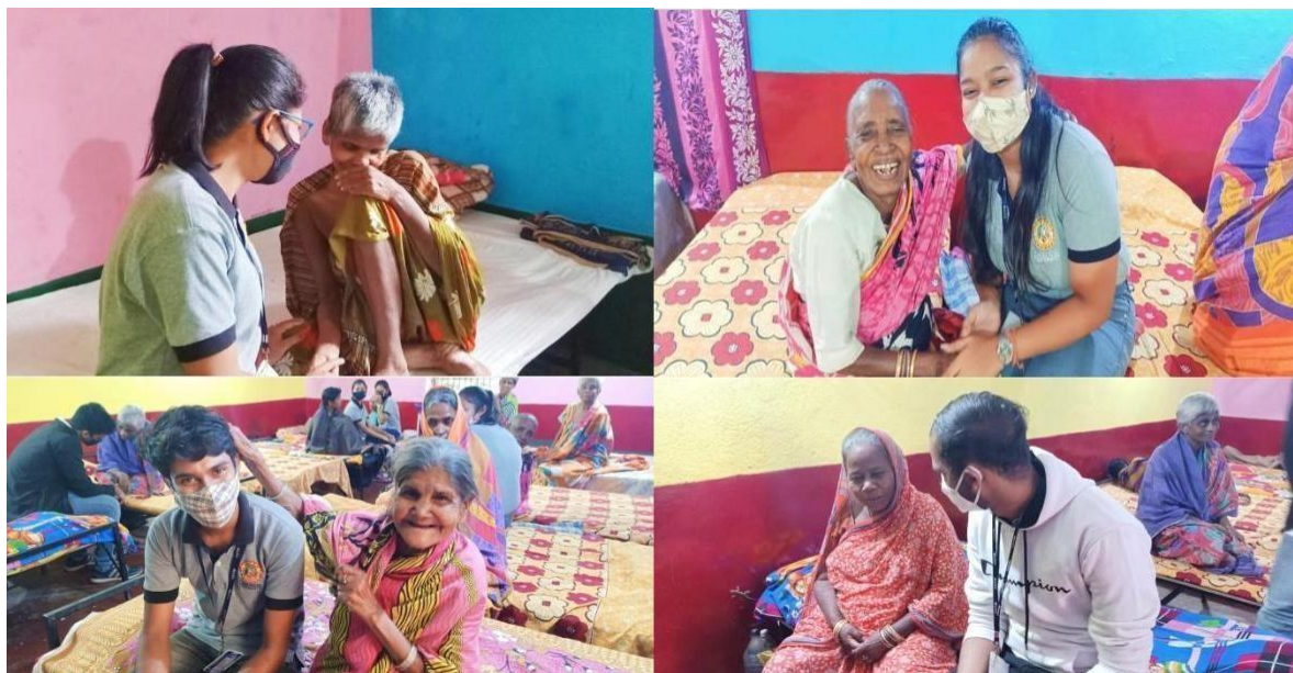
Fig. True happiness

Thanks to all the Student Volunteers to make this occasion successful.