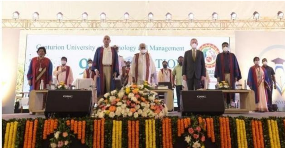
Fig. Dr. Ganeshi Lal (Governor of Odisha)