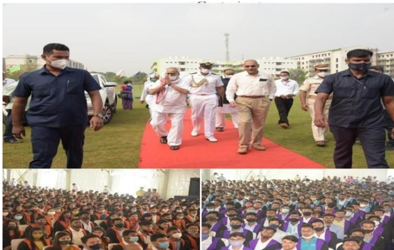
Fig. Pics of convocation