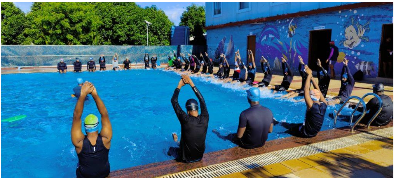
Fig: Inter school Swimming Competition

A healthy body and balanced mind: Swimming keeps a student's heart and lungs healthy, improves strength and flexibility, increases stamina, and even improves balance and posture, and even concentration and memory. Keeping in mind the benefits and results of game and sports in student mental and physical health, Centurion University of technology and management has come up with Swimming Competition (Staff), where 5 Schools Department are participated. Many students took part with their excellent sportsmanship skills, out of which school of engineering and technology was declared the finalist.