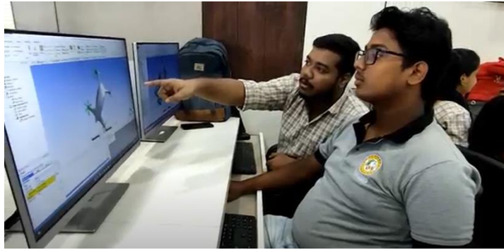
Satellite and TV Communication on 06.11.2019

The followings were points of discussion in the programme