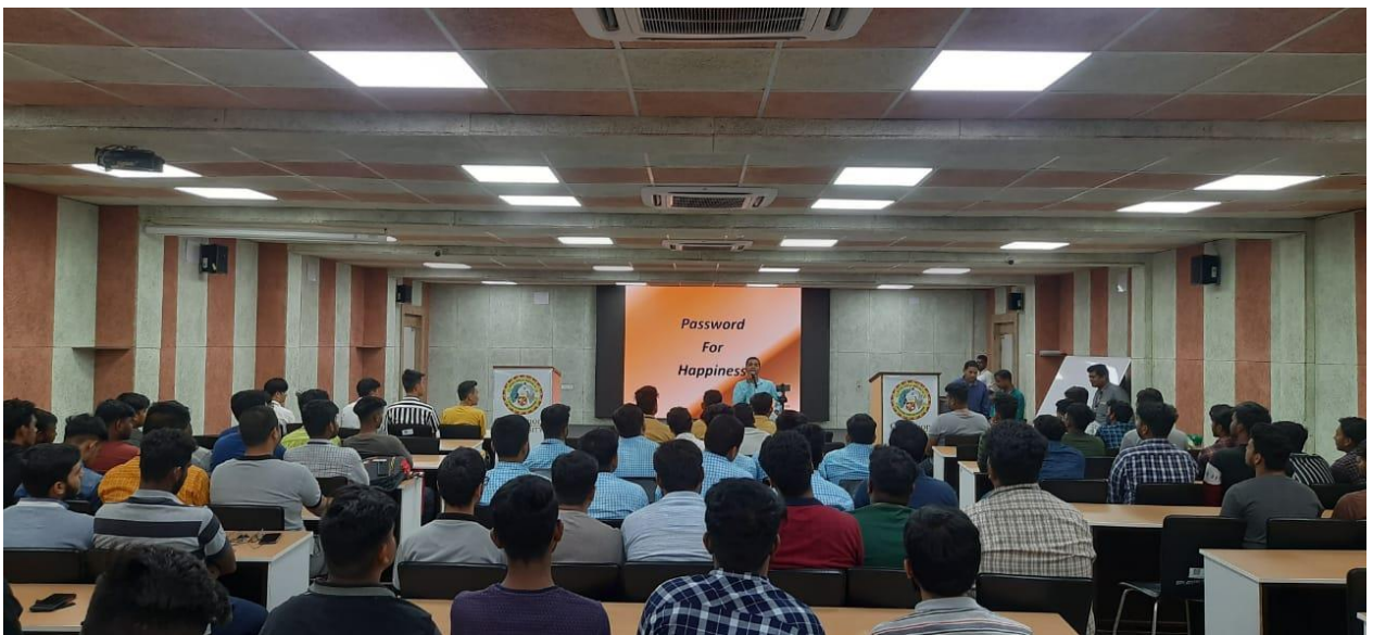
Dt: 05.04.2022, Awareness Programme