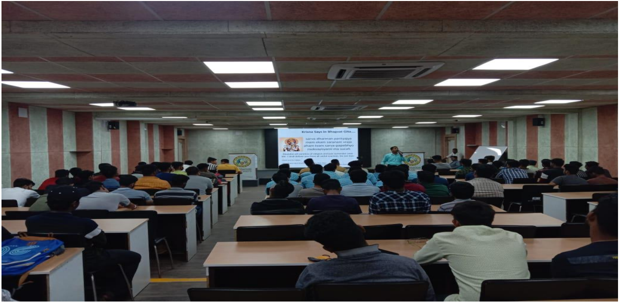
Dt: 05.04.2022, Awareness Programme