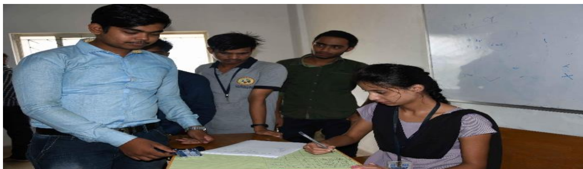
Figure 1 Dt: 24.09.2018, HEALTH CHECK UP CAMP

Thanks to all the student, staff & faculty coordinators of School of Pharmacy & Life Sciences and School of Paramedics & Allied Health Sciences for successfully conducting the program. During program some photographs of the event.