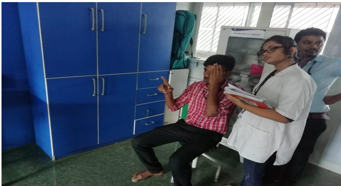
Figure 1 Dt: 15.10.2018,HEALTH CHECK UP CAMP

More than 150 numbers of students, staff, and faculties benefited due of the initiative. Thanks to all the student, staff & faculty coordinators of School of Pharmacy & Life Sciences and School of Paramedics & Allied Health Sciences for successfully conducting the program. During program some photographs.