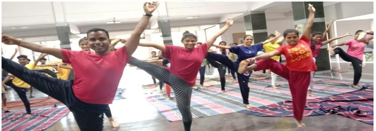
Dt: 07.04.2022, World Health Day