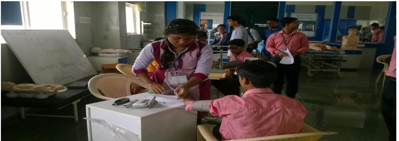
Dt: 15.01.2019, Pathological Investigation Camp

Some of the photographs of the event are attached below.