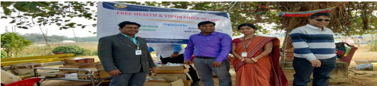
Figure 1 Dt:01.10.2019, HEALTH CHECK UP CAMP

conducting the program. During program some photographs of the event.