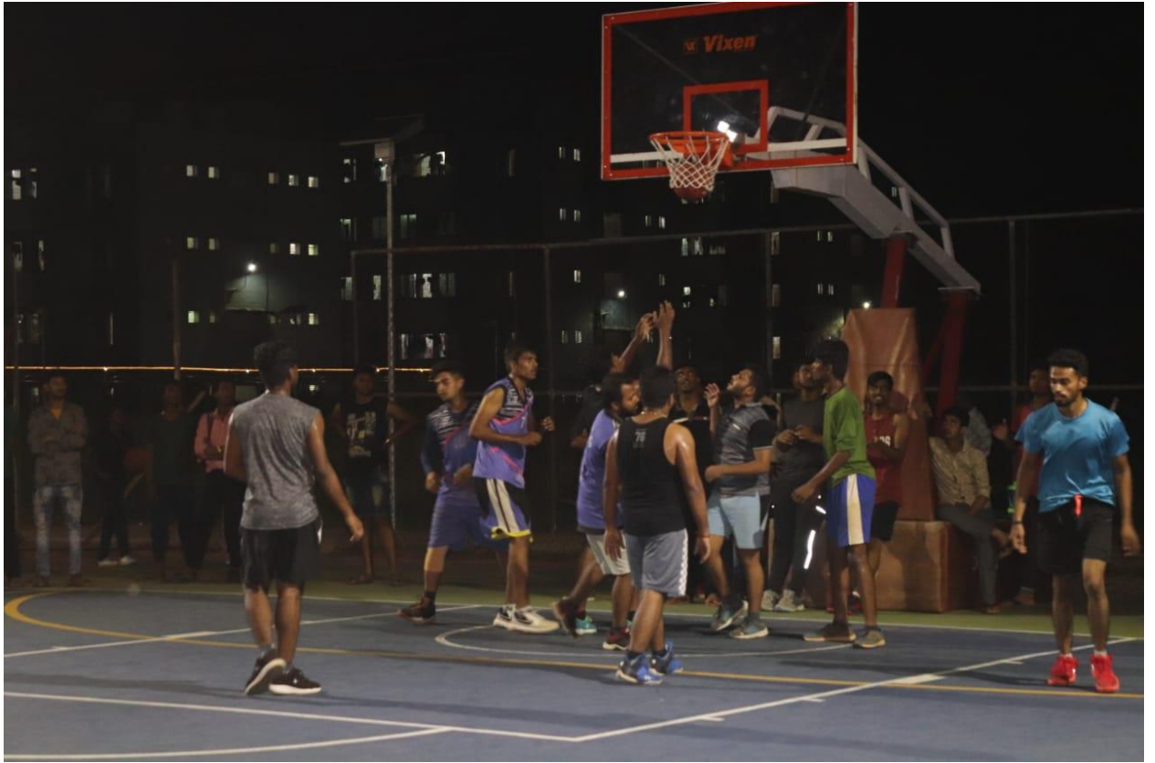
Dt'' 19.10.2019, Basket Ball Training