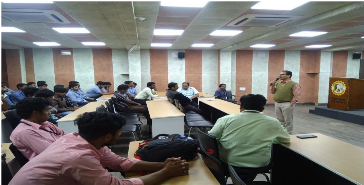
Figure 1 Dt: 16.12.2019, Anti-Drug Campaign