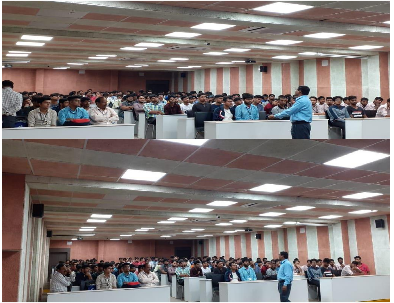
Figure 1Dt:24.01.2020,Programme on "Ill Effects of Drug Abuse"