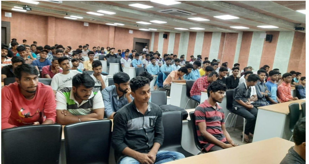
Figure 1 Dt13.03.2020, Programme on "Ill Effects of Drug Abuse"

WISH YOU ALL A HAPPY, HEALTHY & DRUGS FREE LIVING!