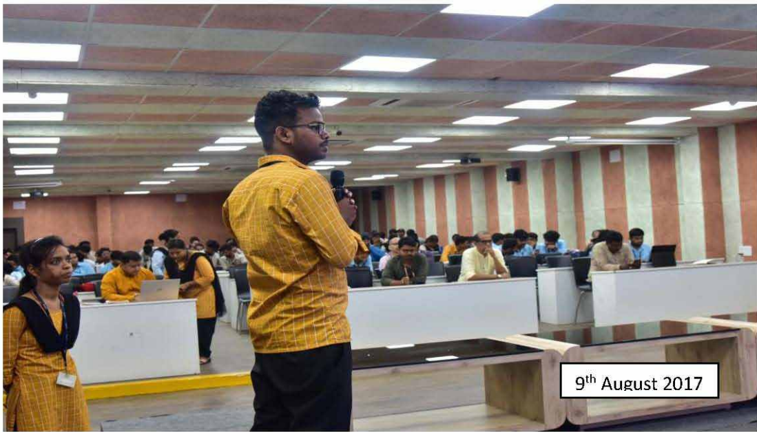
Participant speaking in a public forum