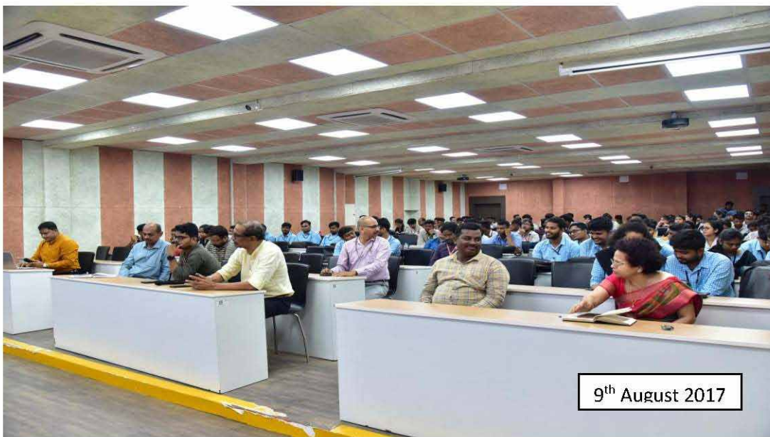
Audience listening to different participants