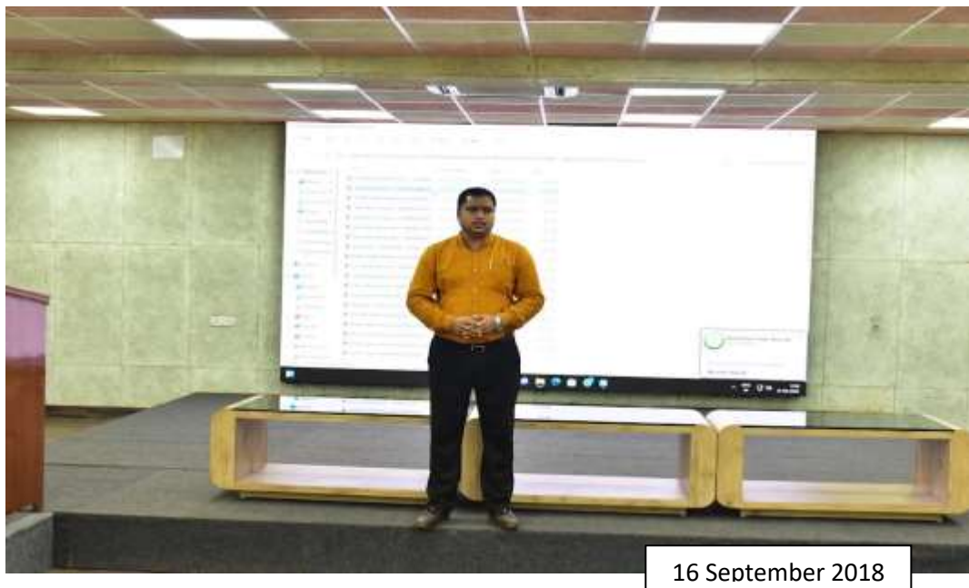
(A student giving a one-minute speech)