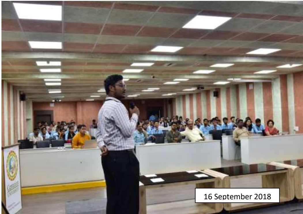
(A student giving a one-minute speech)