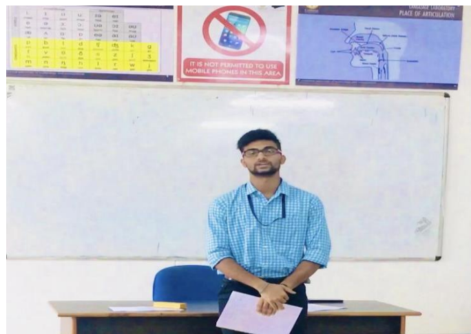
JAM on Technology is Spoiling the Creativity of Students, 14 October 2019