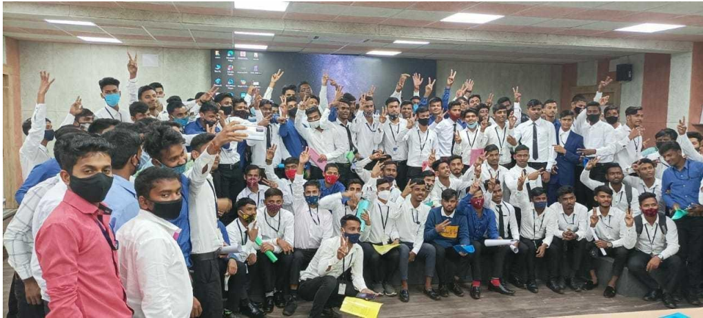
Glimpses from the Workshop, 11.2.2020

The workshop was attended by 432 participants who were interested in improving their language proficiency. The participants were from diverse backgrounds, including students, professionals, and language enthusiasts. The main objective of the workshop was to enhance the language proficiency of the participants through skill-building activities. The workshop aimed to improve the participants' reading, writing, speaking, and listening skills, and to provide them with strategies to continue developing their language proficiency independently. The final session was on listening skills, and it included activities such as listening for gist, listening for details, and note-taking.