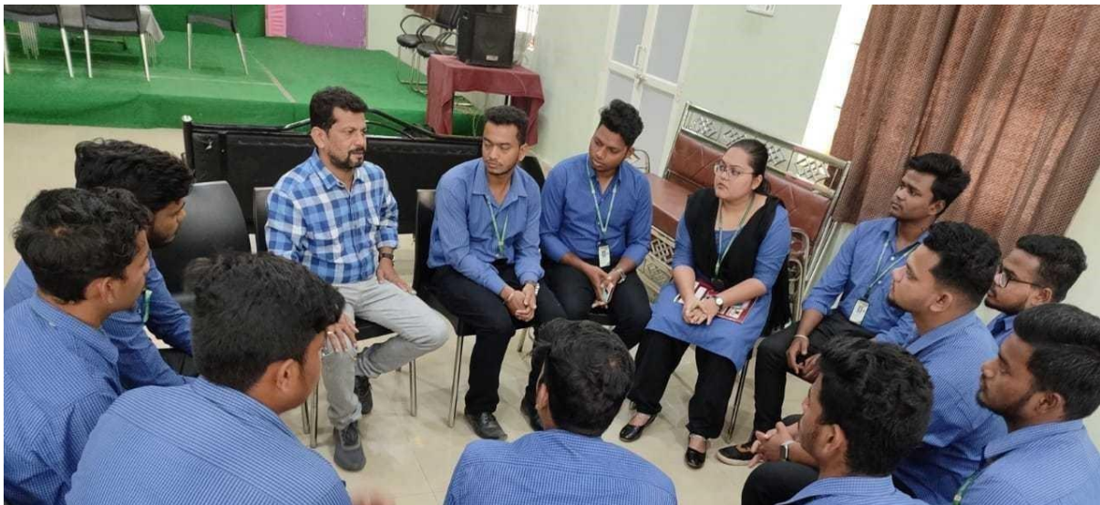
Discussion in Breakout Rooms, 24th November 2017

Personal or Individual counselling (sometimes called psychotherapy, talk therapy, or treatment) is a process through which faculties work with students in a trend of one-on-one with a trained mental health clinician in a safe, caring, and confidential environment. Counselling allows individuals to explore their feelings, beliefs, and behaviours, work through challenging or influential memories, identify aspects of their lives that they would like to change, better understand themselves and others, set personal goals, and work towards desired changes. The event was organized on 24th November 2017 and the number of students enrolled were 99.