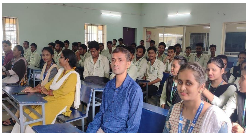
Welcome Speech to the Audience