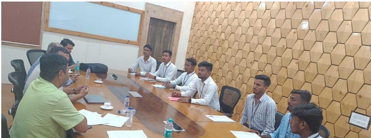
Mock interview sessions with small groups on 3 July 2018

The workshop provided a conducive platform to the participants to groom them up into better individuals making them highly efficient to excel in their chosen workplaces. After the valuable inputs students divide into groups for practice sessions.