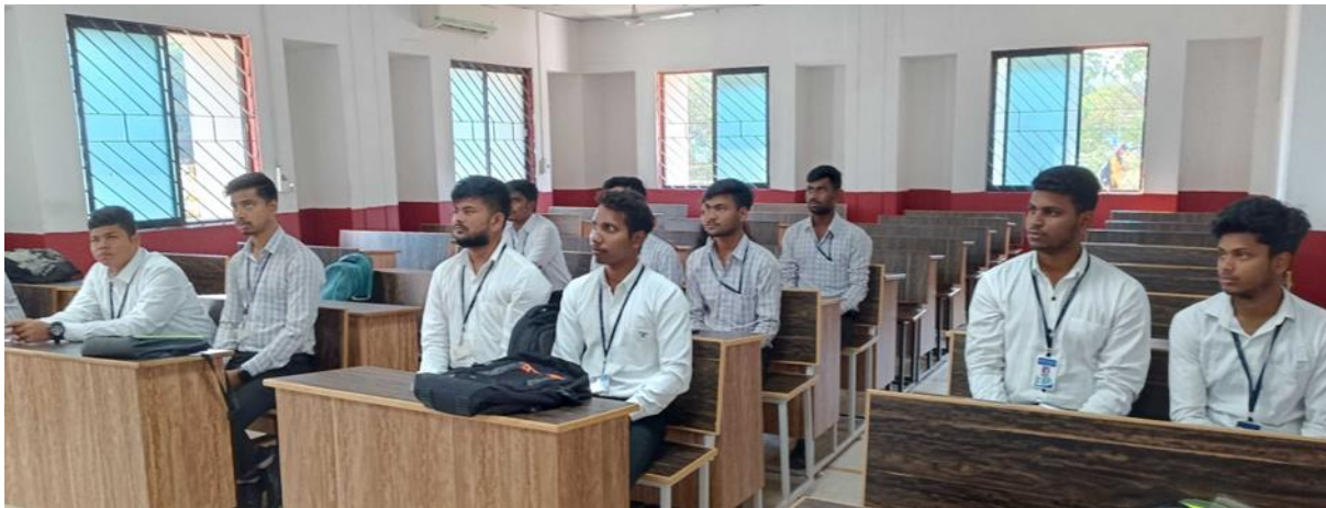
Professional growth being discussed on 20 th September, 2018