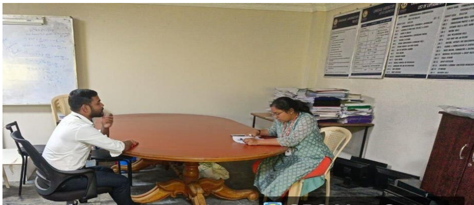
Student during personal counselling session on 21st September 2018

The personal counselling workshop organized for the students of SOM at Centurion University of Technology and Management on 21st September 2018 with a total of 90 participants focussed on providing career guidance to students through an analysis of their abilities, interests, personality, and for whom corresponding work environments and occupations ought to be identified. Additionally, the workshop also stressed the modern approaches to personal counselling such as life design and career construction. According to these approaches, personal counselling is about helping students to construct a subjectively meaningful identity to increase their self-reflection and help them create their careers according to their personal identity and life story.