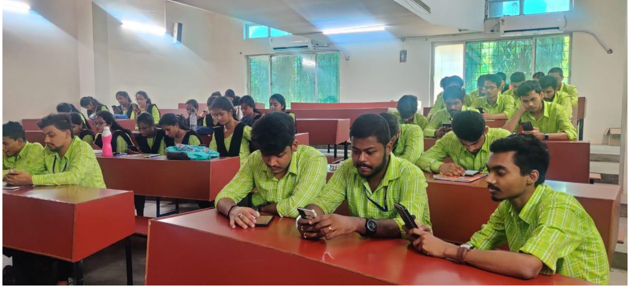
Students engaged in task during the session on 16th July, 2020