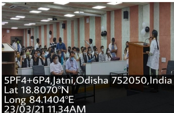
Figure 2: 23.03.2021, SOPAHS_Career Talk on the topic Opportunities of Optometrist