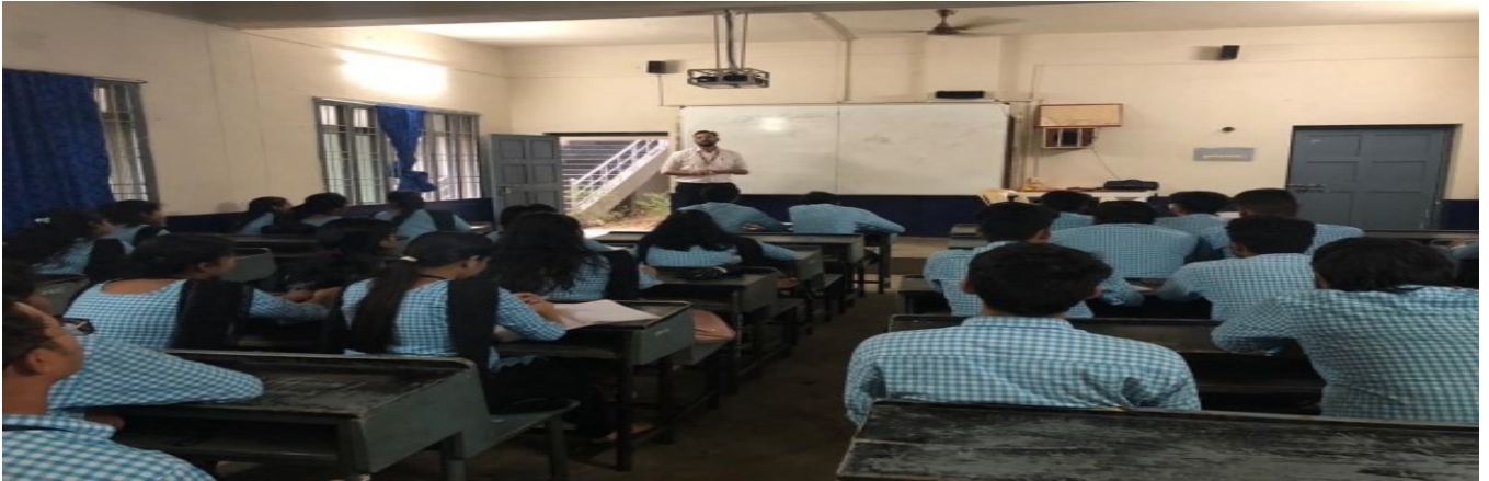
Figure 2: 31.01.2022, SOABE_GATE & JRF COACHING