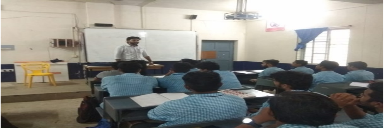
Figure 1: 31.01.2022, SOABE_GATE & JRF COACHING