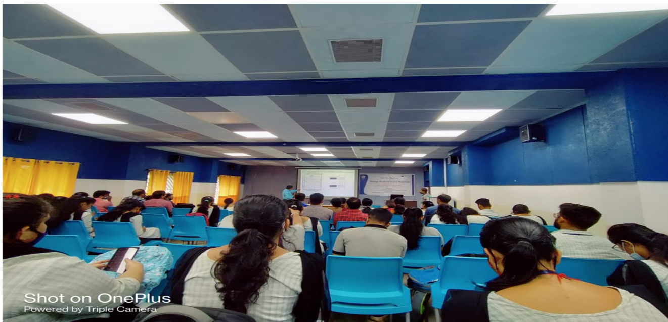
Figure 1: 30.09.2021, Botany_Gate Coaching