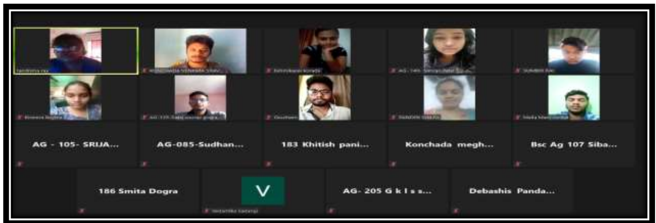
Figure 2: 29.12.2020, TCS CSR Youth Employment Program in progress in virtual mode