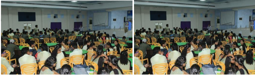
Figure 1: 11.11.2019, Mechanical_career counseling