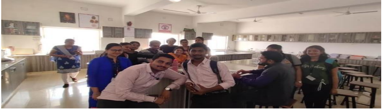
Figure 1: 30.01.2020, ZOOLOGY_NET-GATE

Shaping Lives... Empowering Communities...