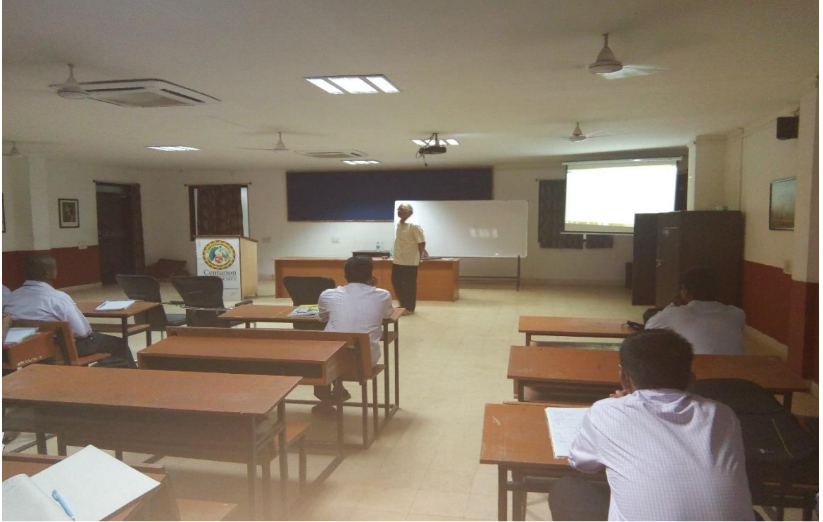
Figure 1: 15.01.2020, Mathematics_NET_GATE

Shaping Lives... Empowering Communities...