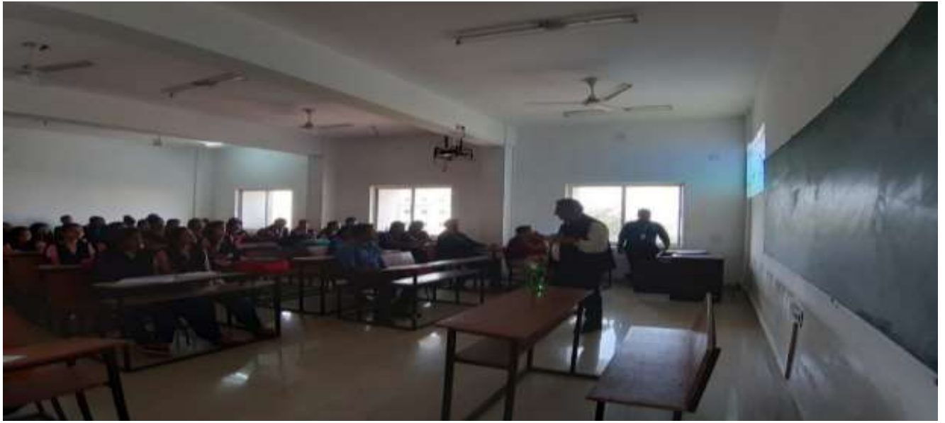
Figure 1: 10.05.2019, Botany_Career counseling 2